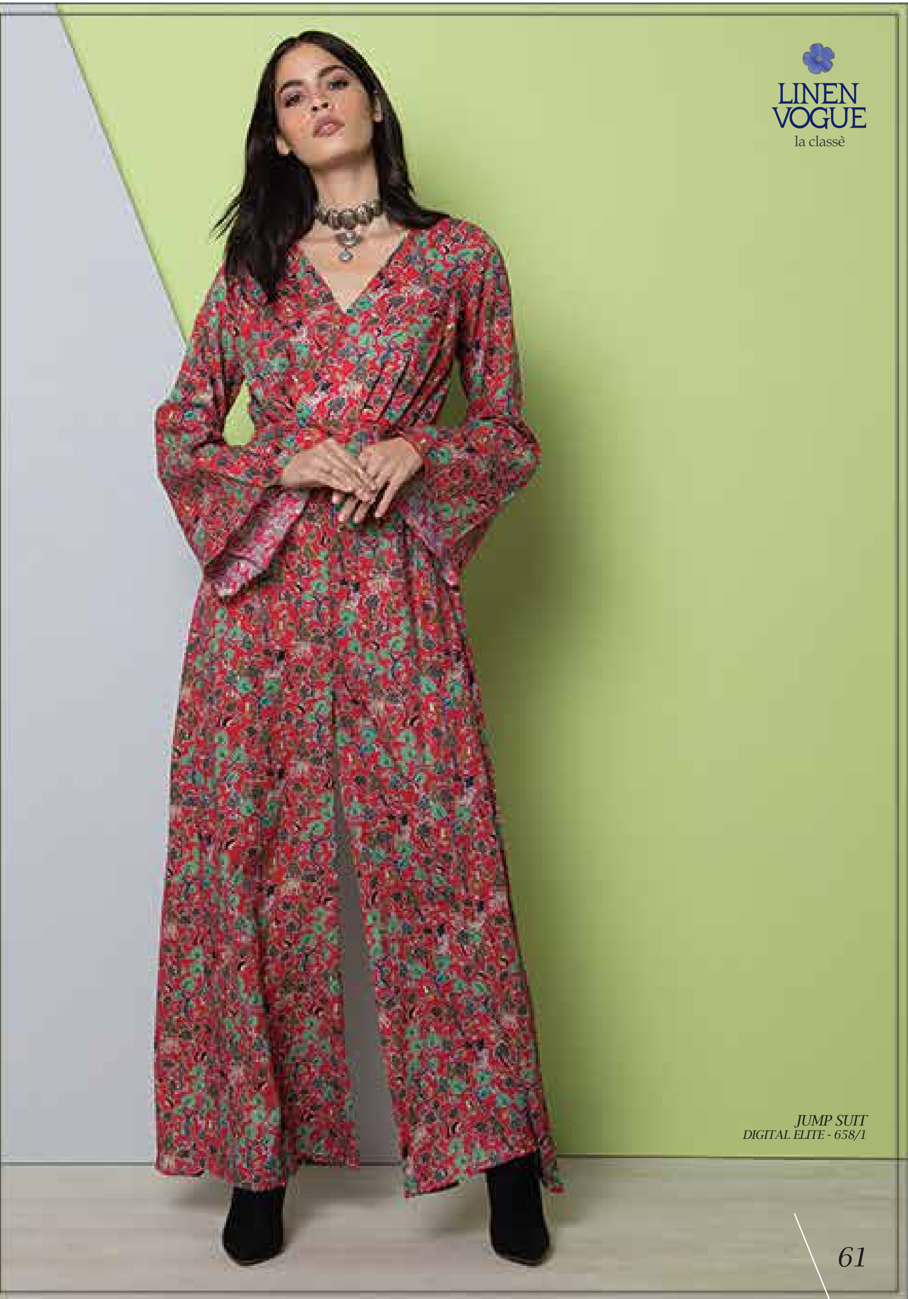
JUMP SUIT DIGITAL ELITE - 658/1