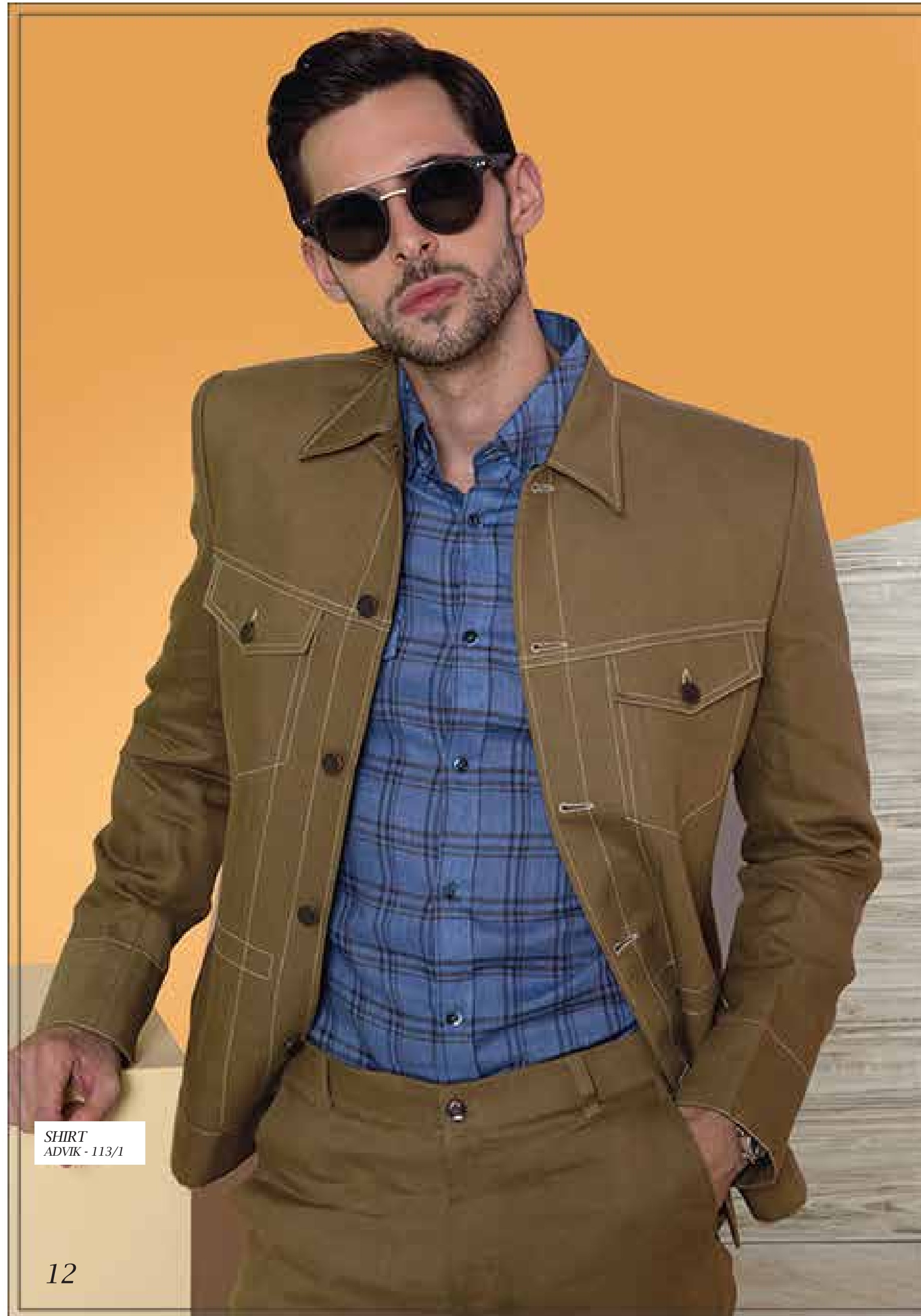
SHIRT ADVIK - 113/1