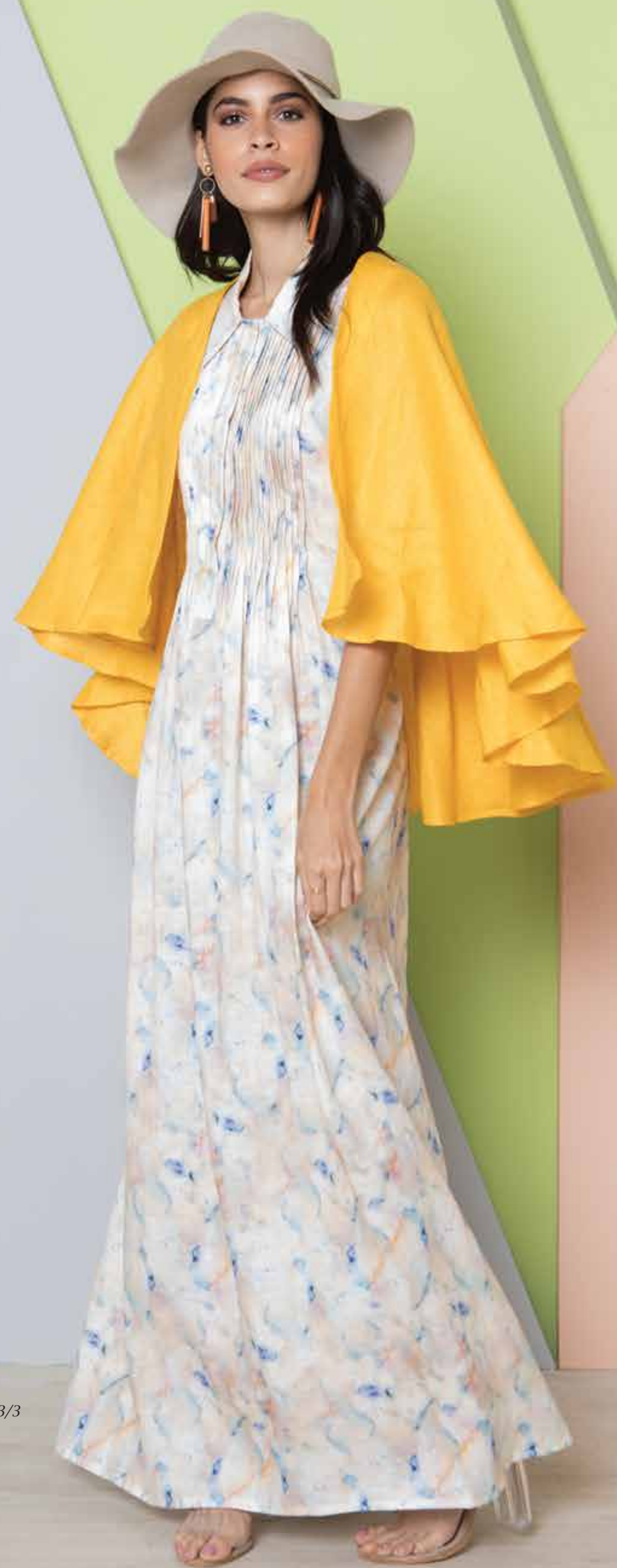
CAPE MARTINI - 145/62 DRESS DIGITAL ELITE - 673/3