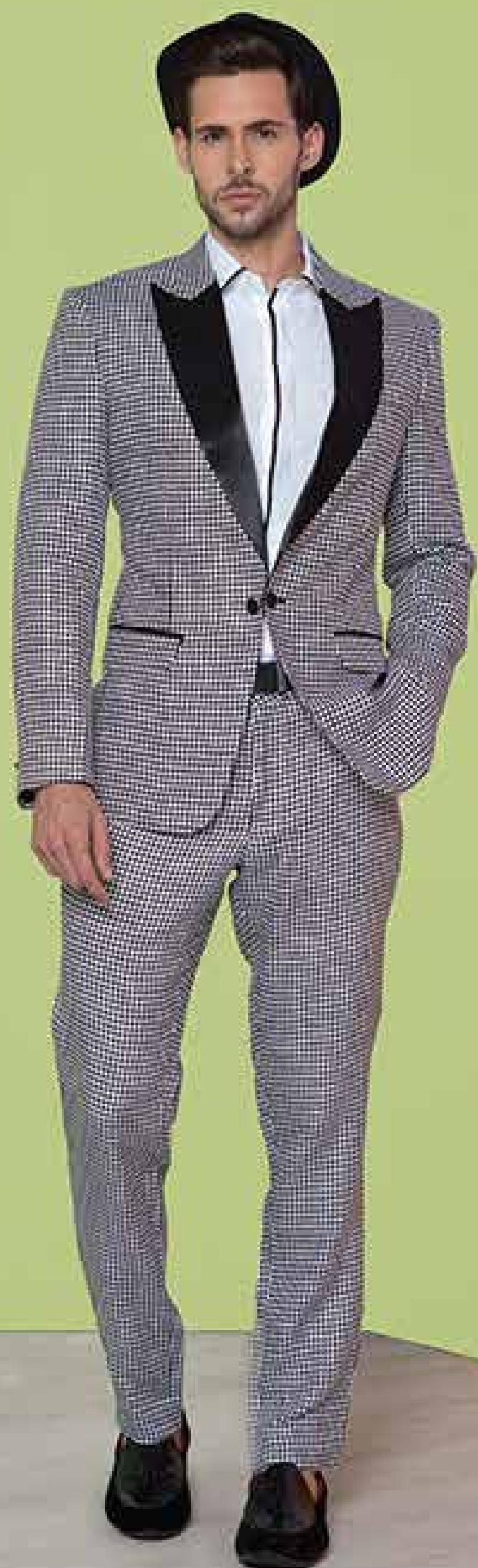
SUIT MOJITO - 549/1