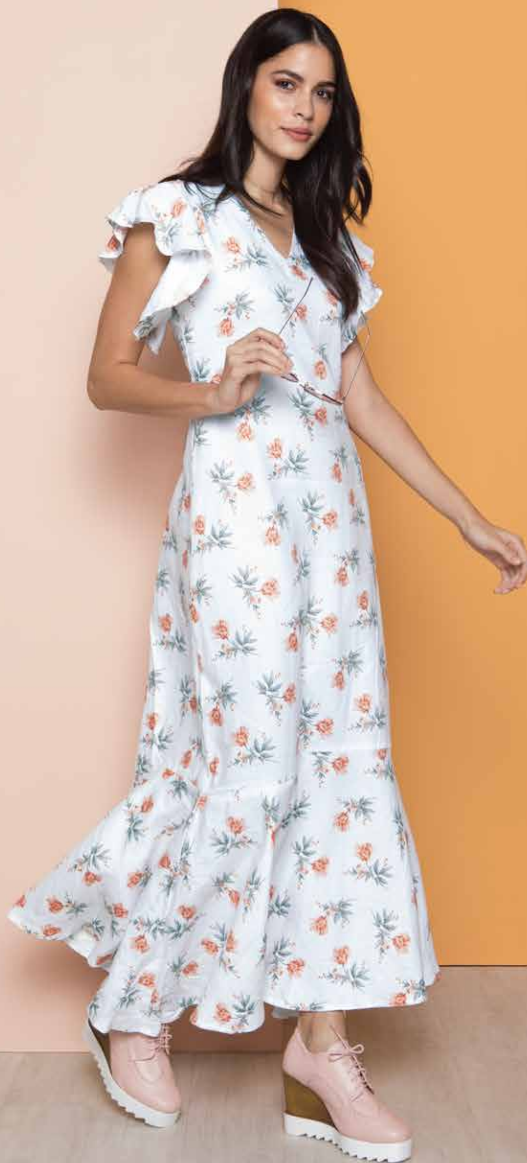
DRESS DIGI ROOST - 149/1