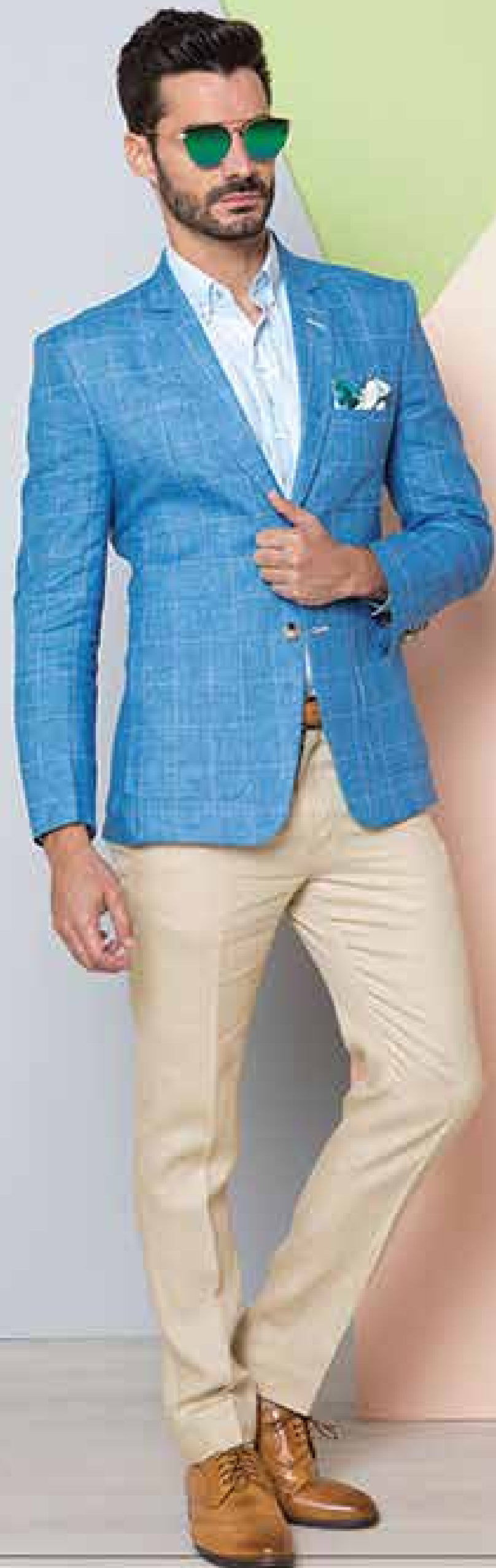
TROUSERS FOREST - SAND