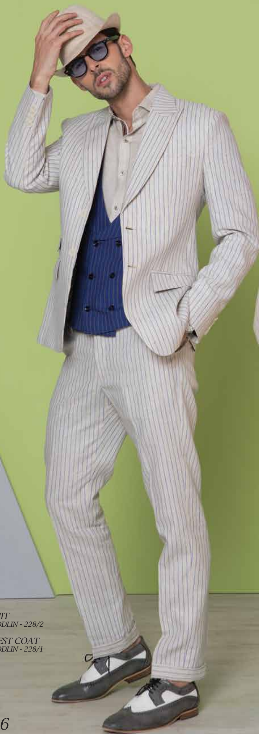
SUIT MODLIN - 228/2