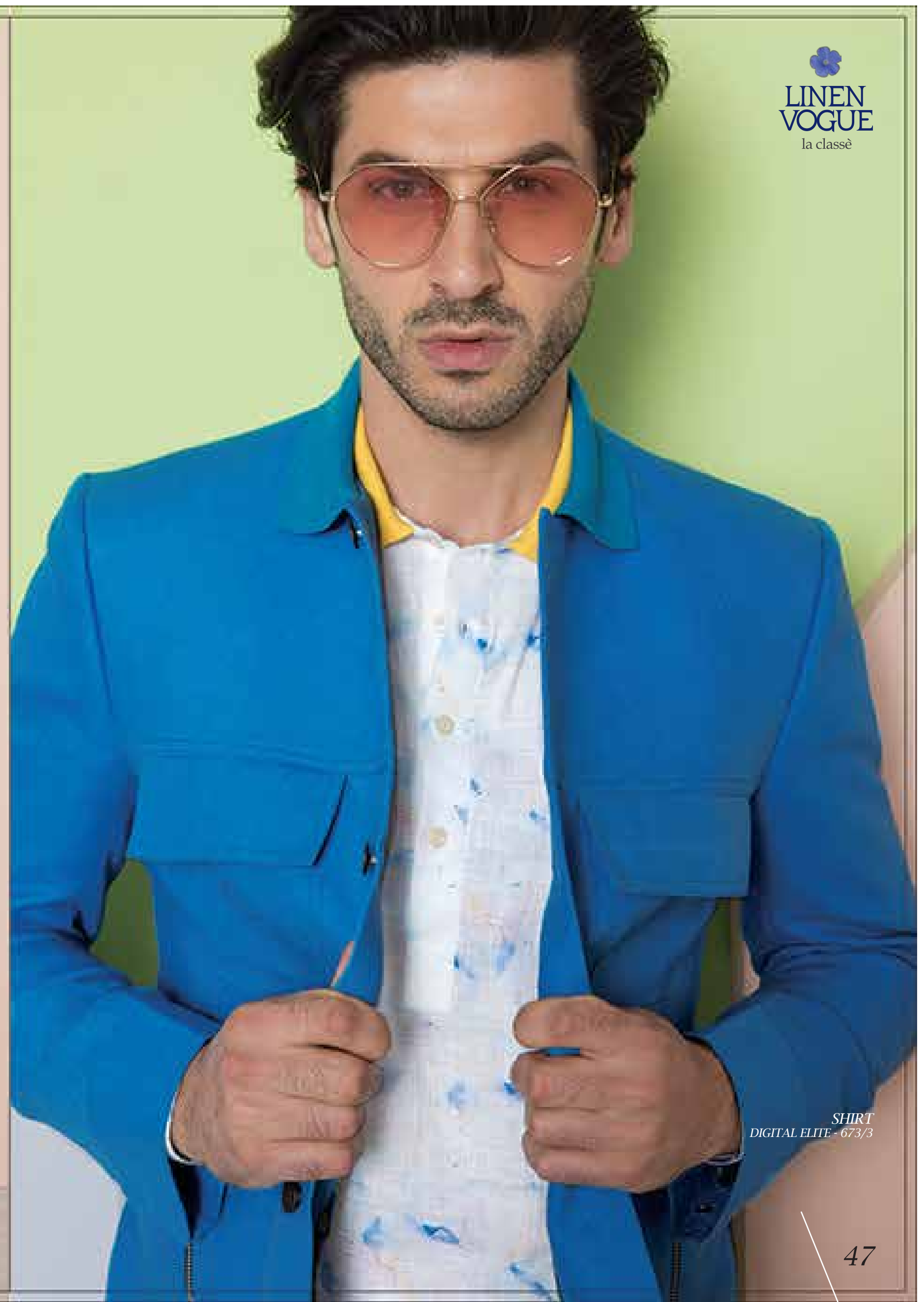
SHIRT DIGITAL ELITE - 673/3