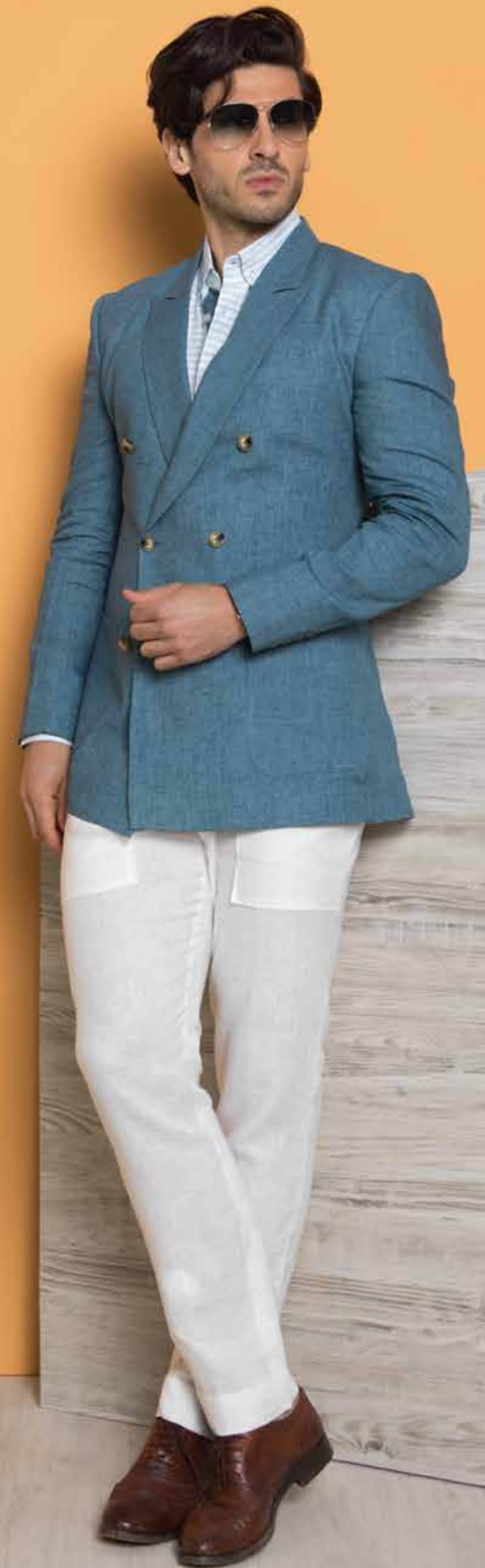
BLAZER MAGARITA - SH 9