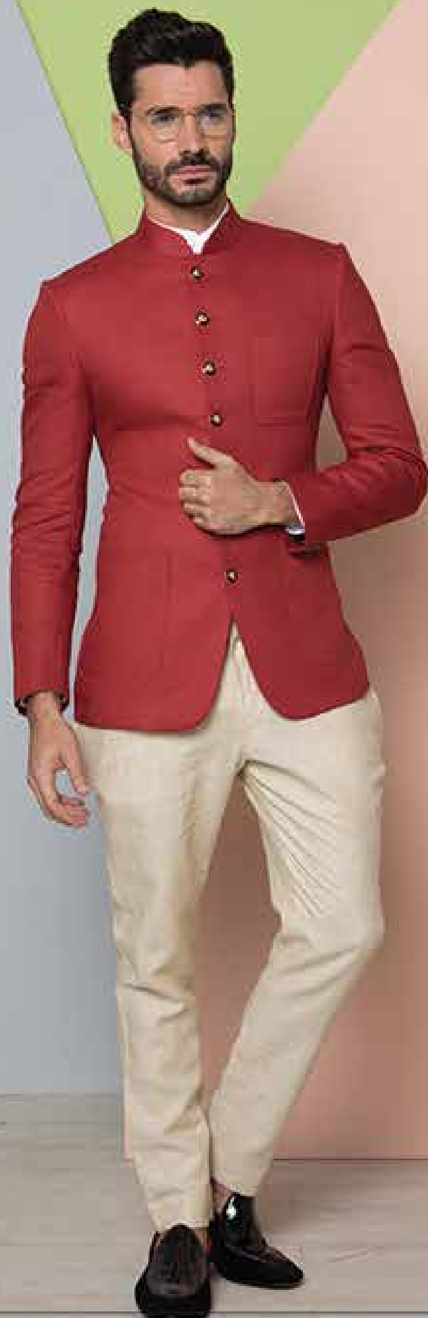
JACKET FOREST - ROSSO RED