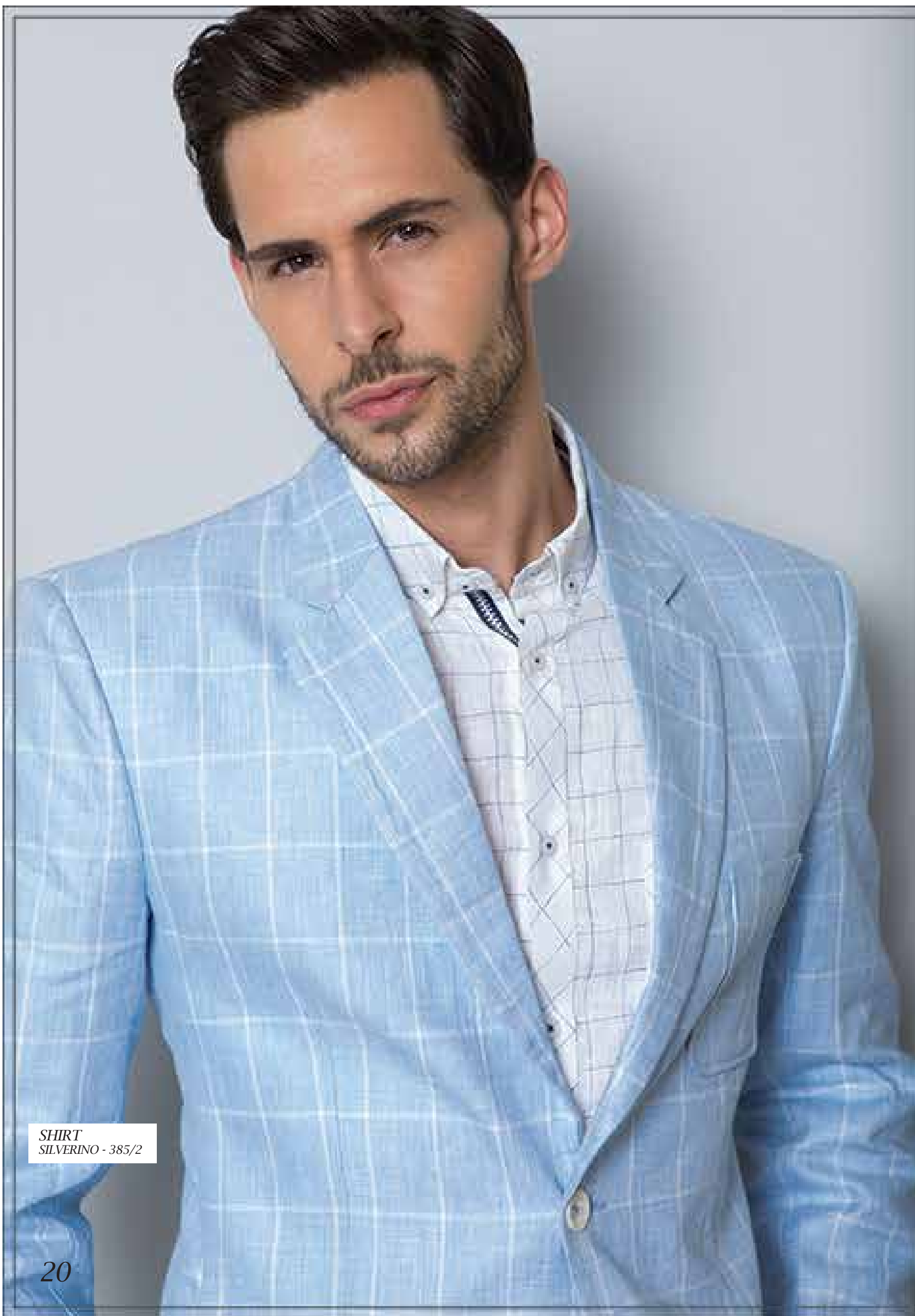
SHIRT SILVERINO - 385/2