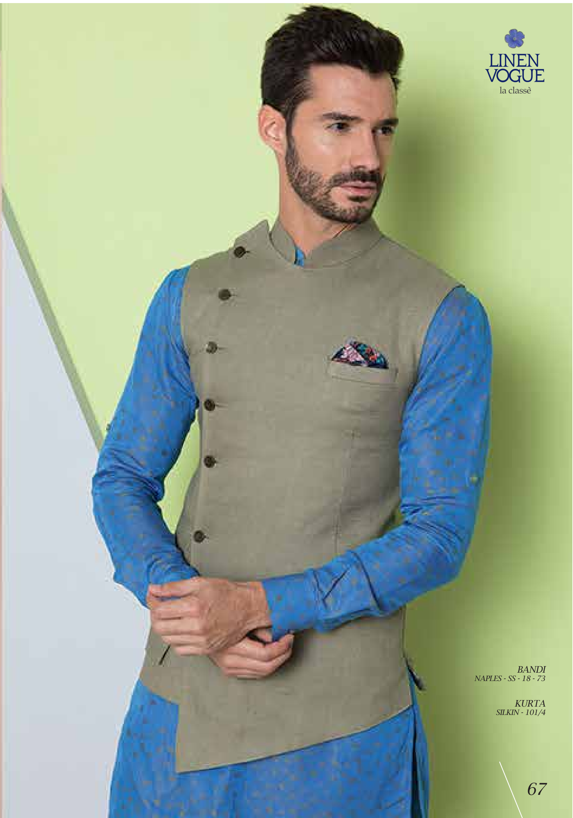
BANDI NAPLES - SS - 18 - 73