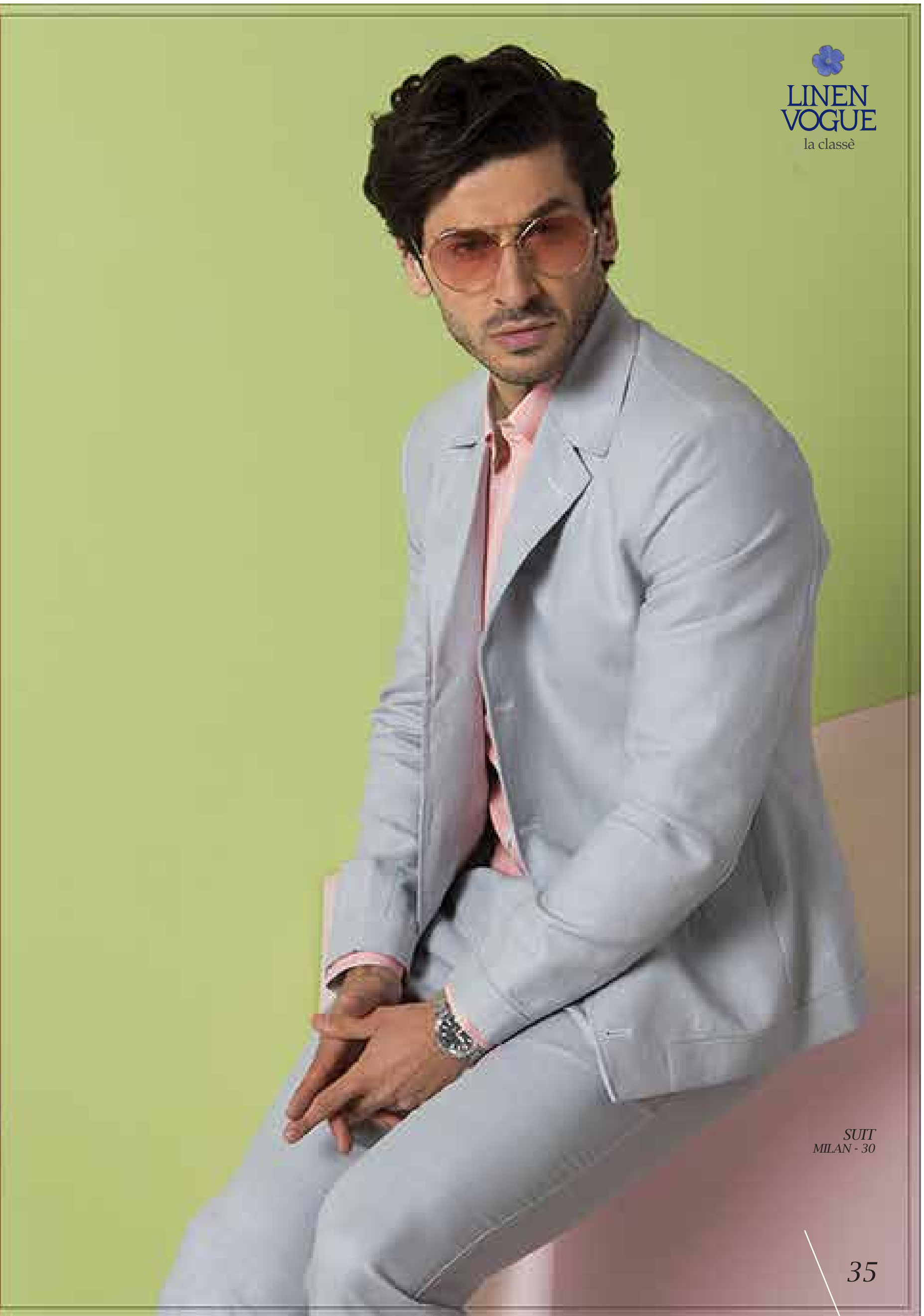
SUIT MILAN - 30