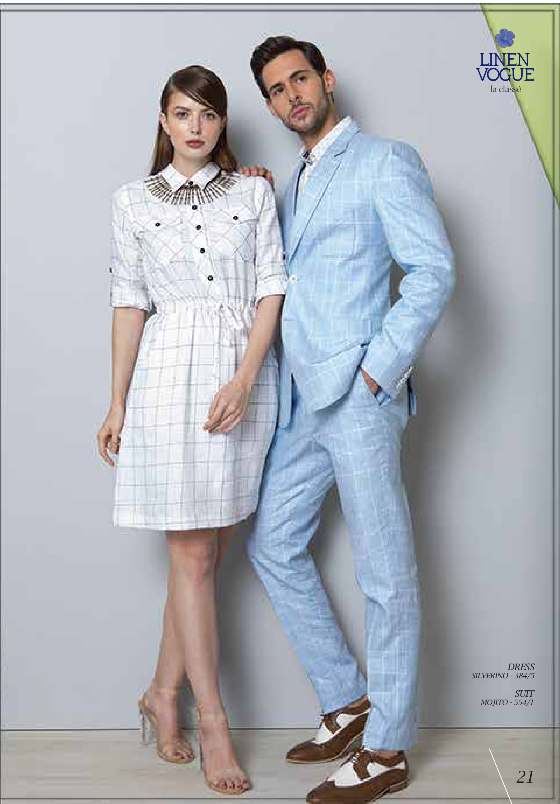
DRESS SILVERINO - 384/5