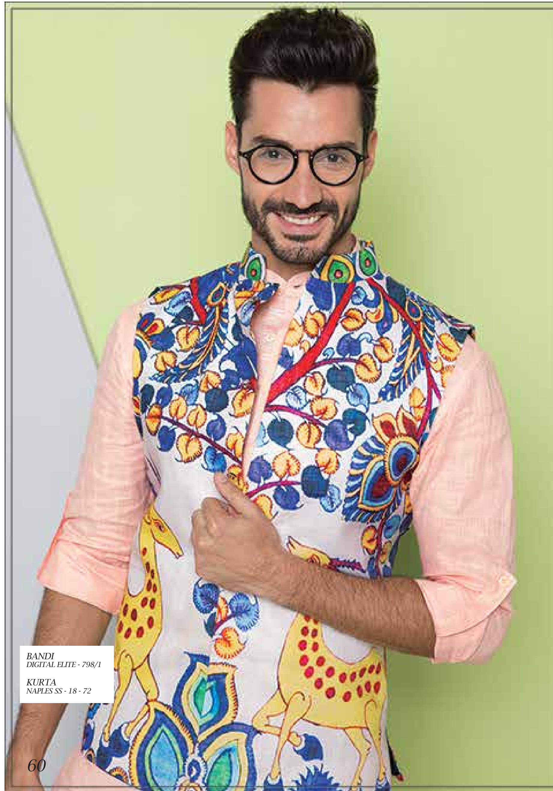
BANDI DIGITAL ELITE - 798/1