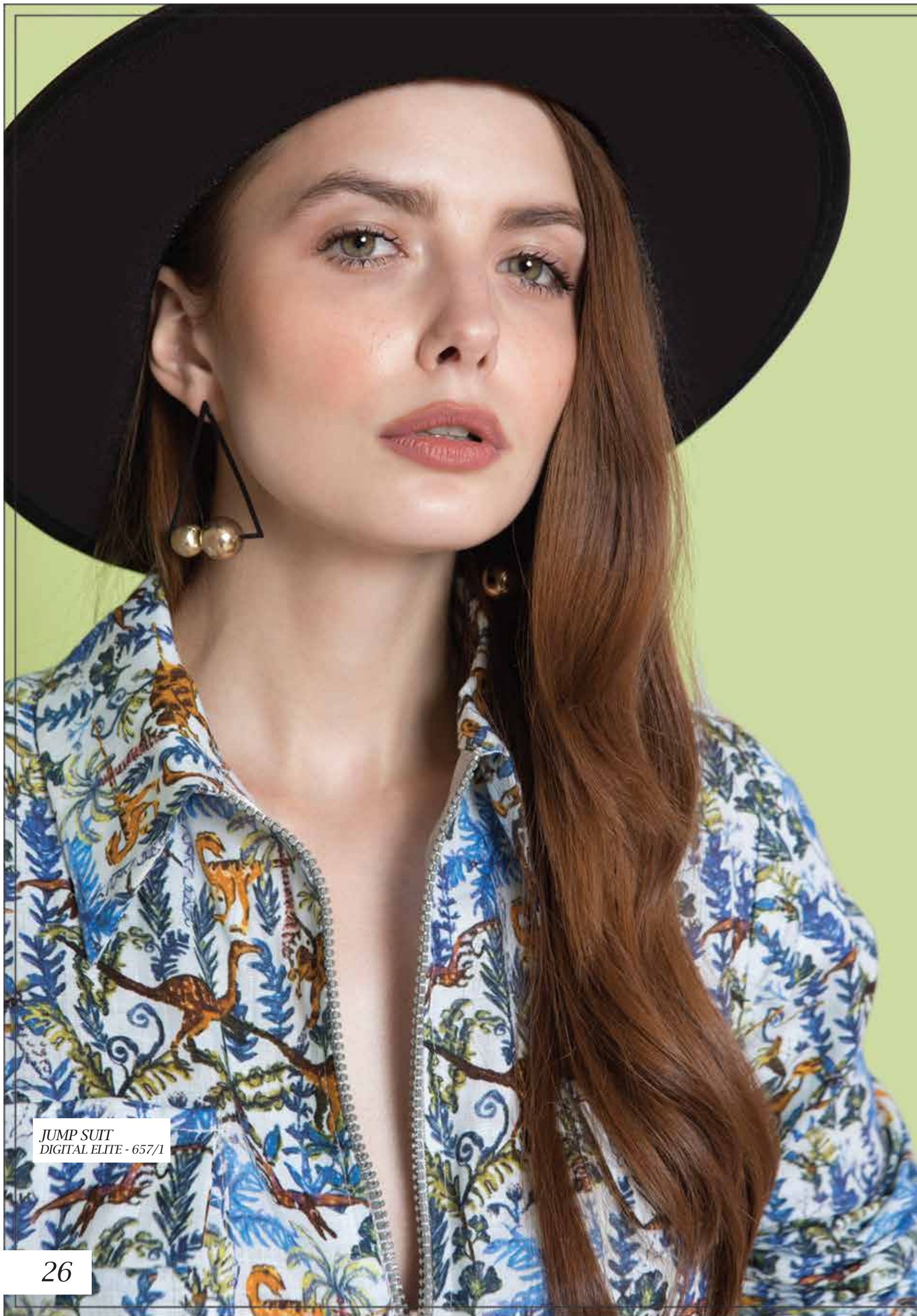
JUMP SUIT DIGITAL ELITE - 657/1