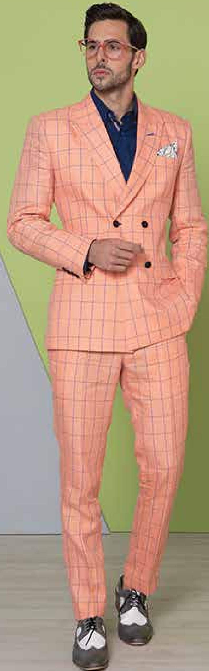
SHIRT PISA - SS - 18 - 36 SUIT MOJITO - 556/1