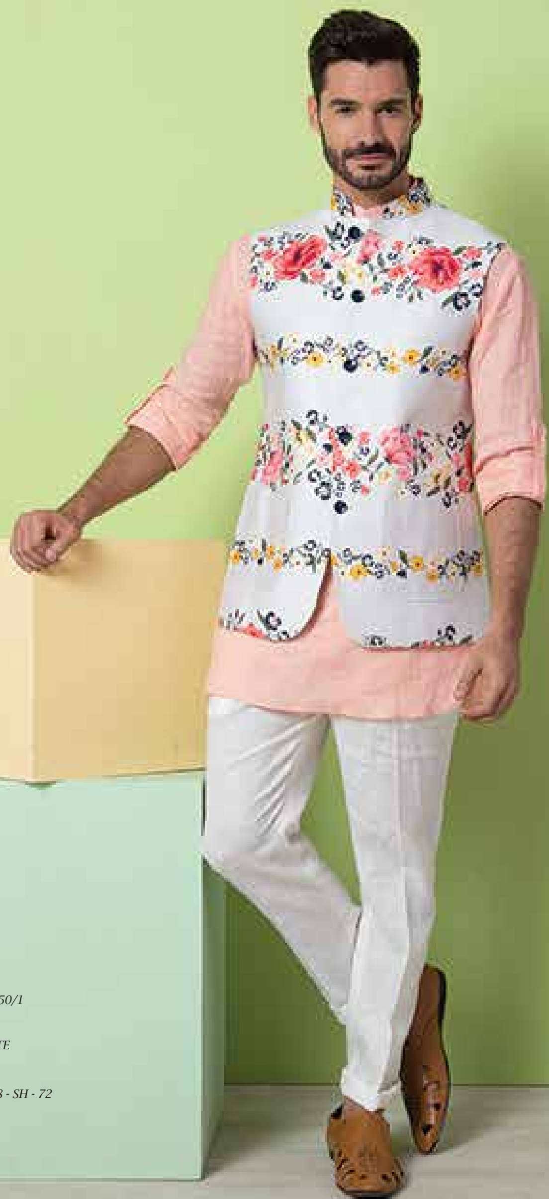
BANDI DIGI ROOST - 150/1