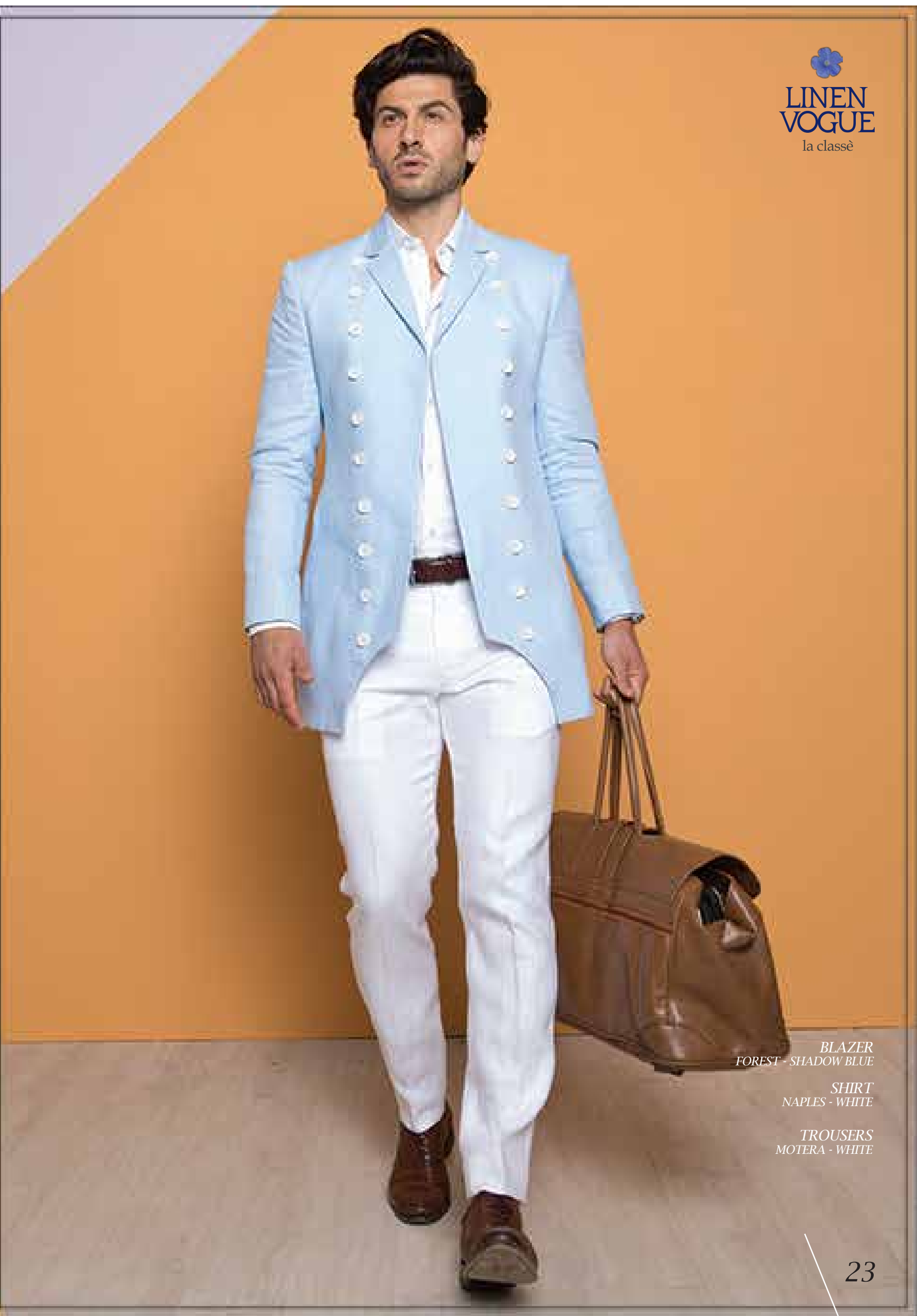
BLAZER FOREST - SHADOW BLUE SHIRT NAPLES - WHITE TROUSERS MOTERA - WHITE