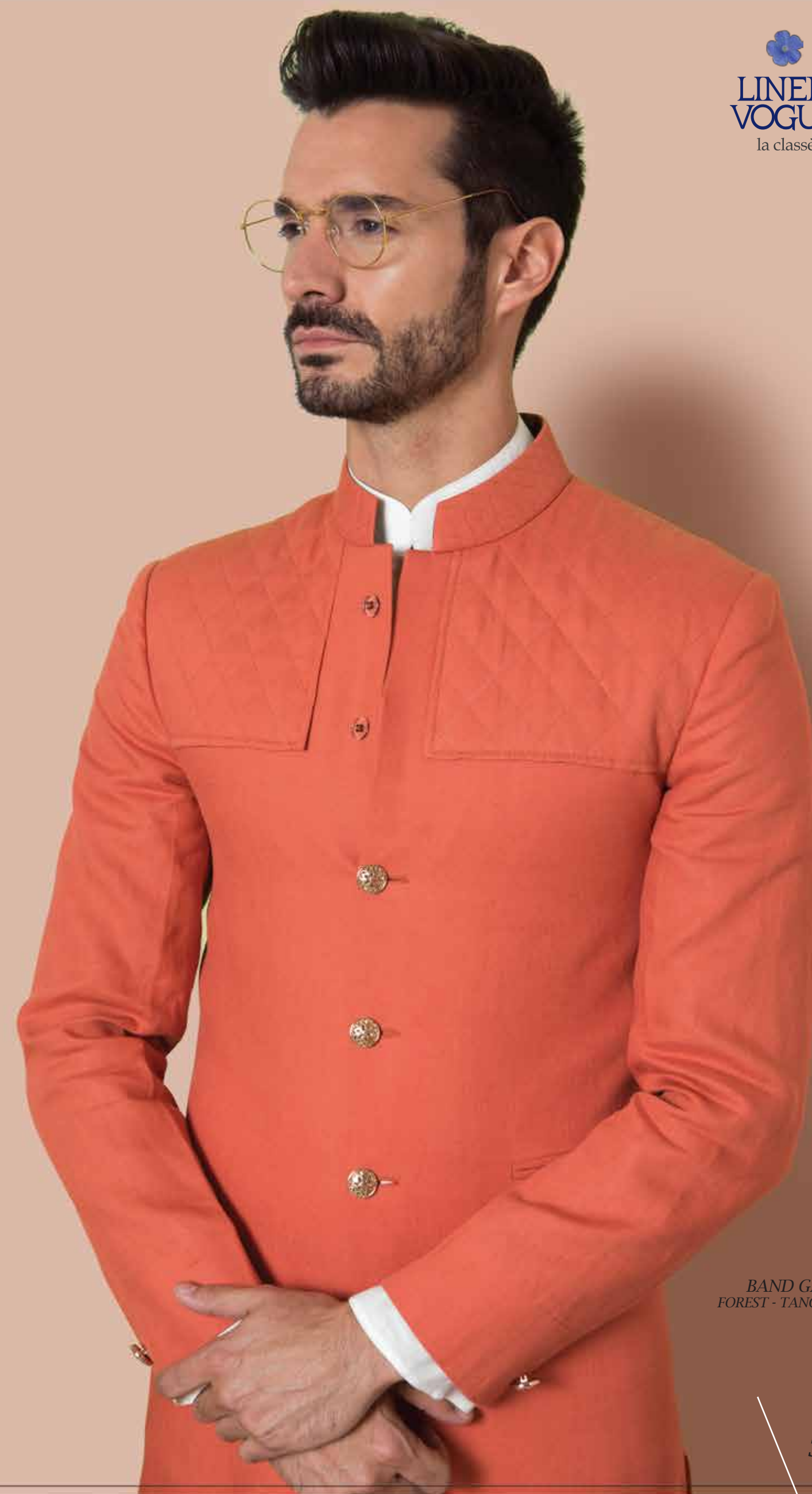
BAND GALA FOREST - TANGELO