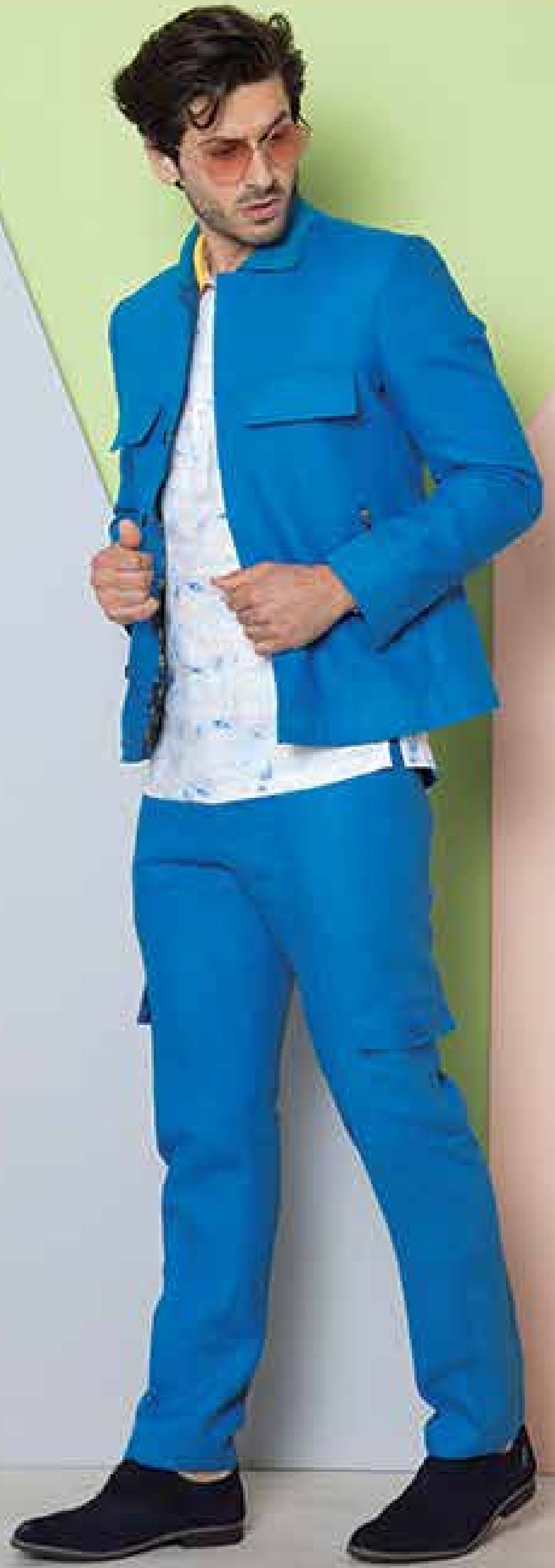
SUIT RETRO - TEAL BLUE