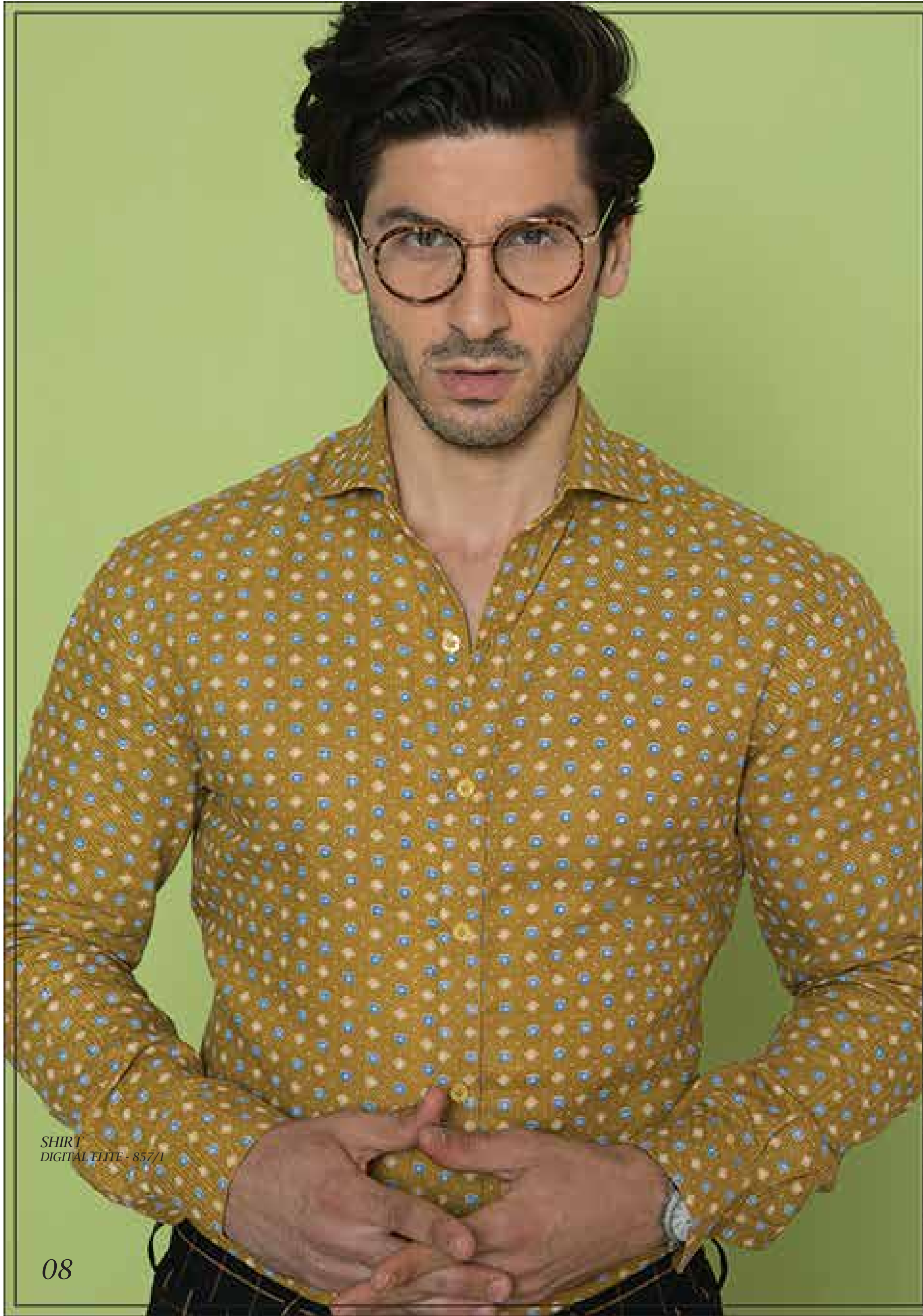
SHIRT DIGITAL ELITE - 857/1