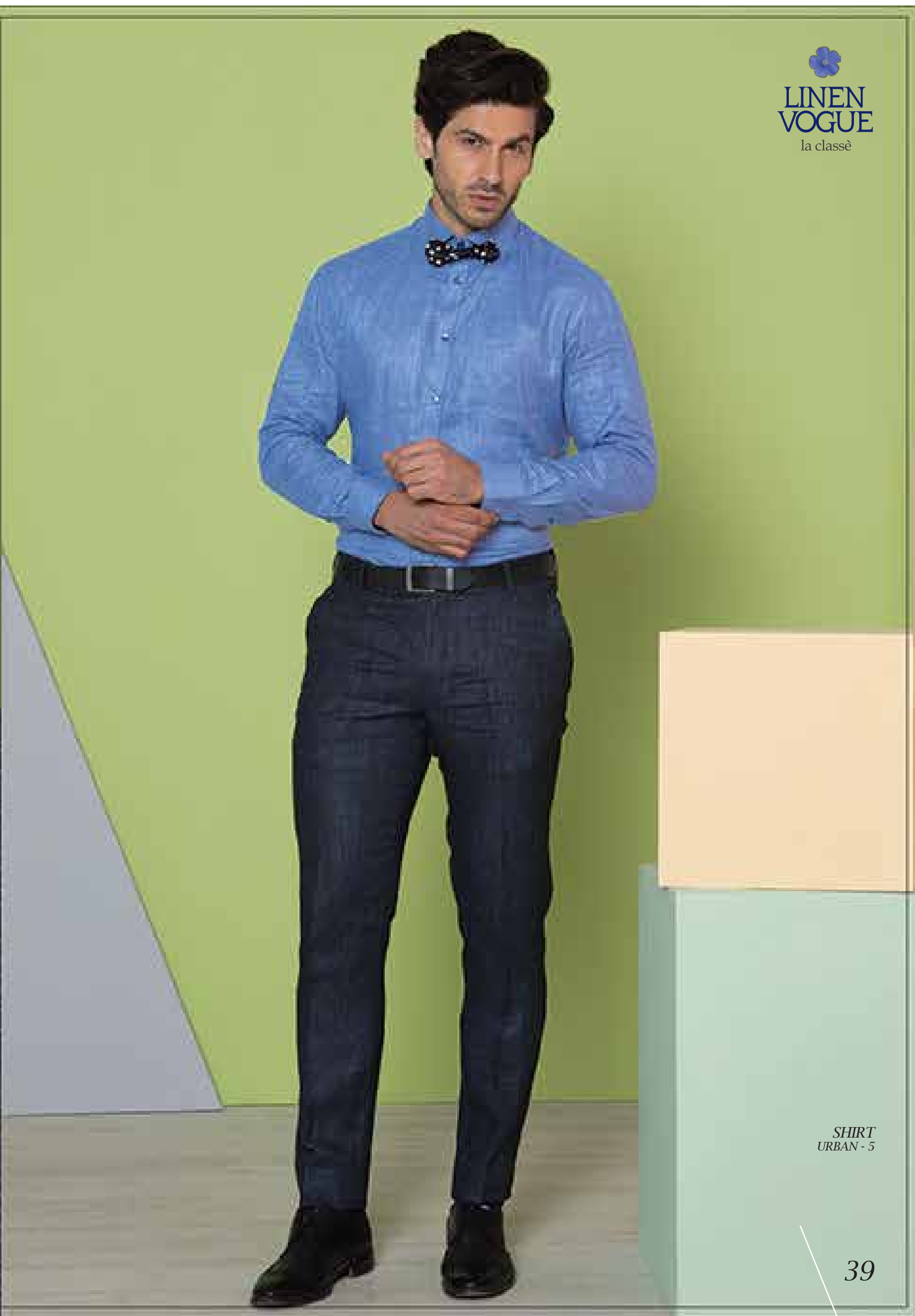
SHIRT URBAN - 5