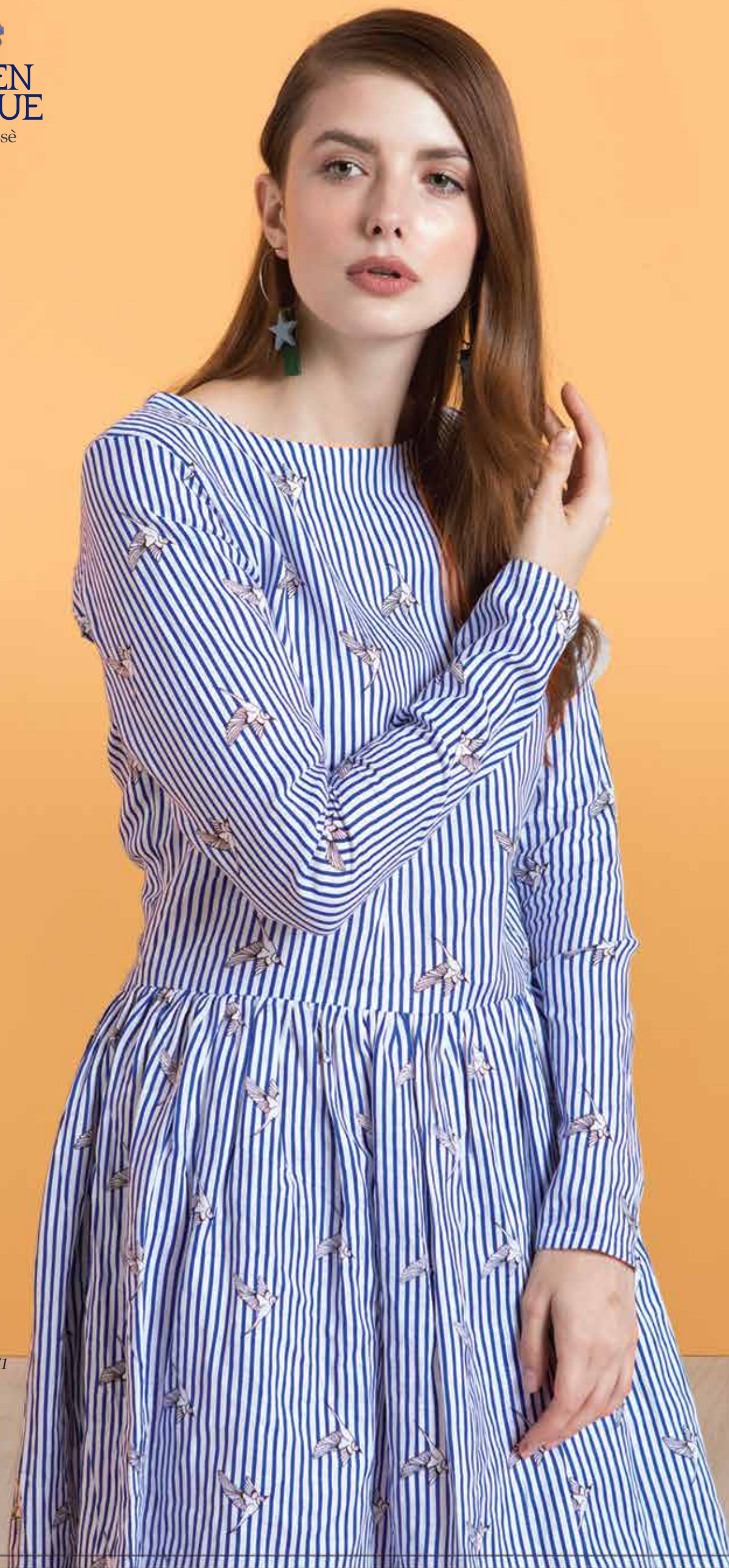
DRESS ASHLEY - 2267/1