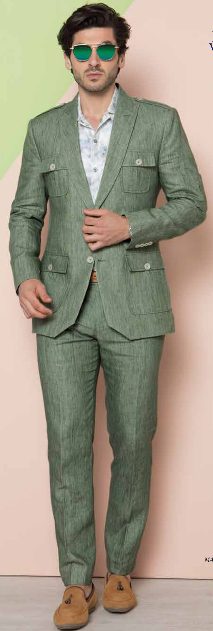
SUIT MAGARITA - SH 10