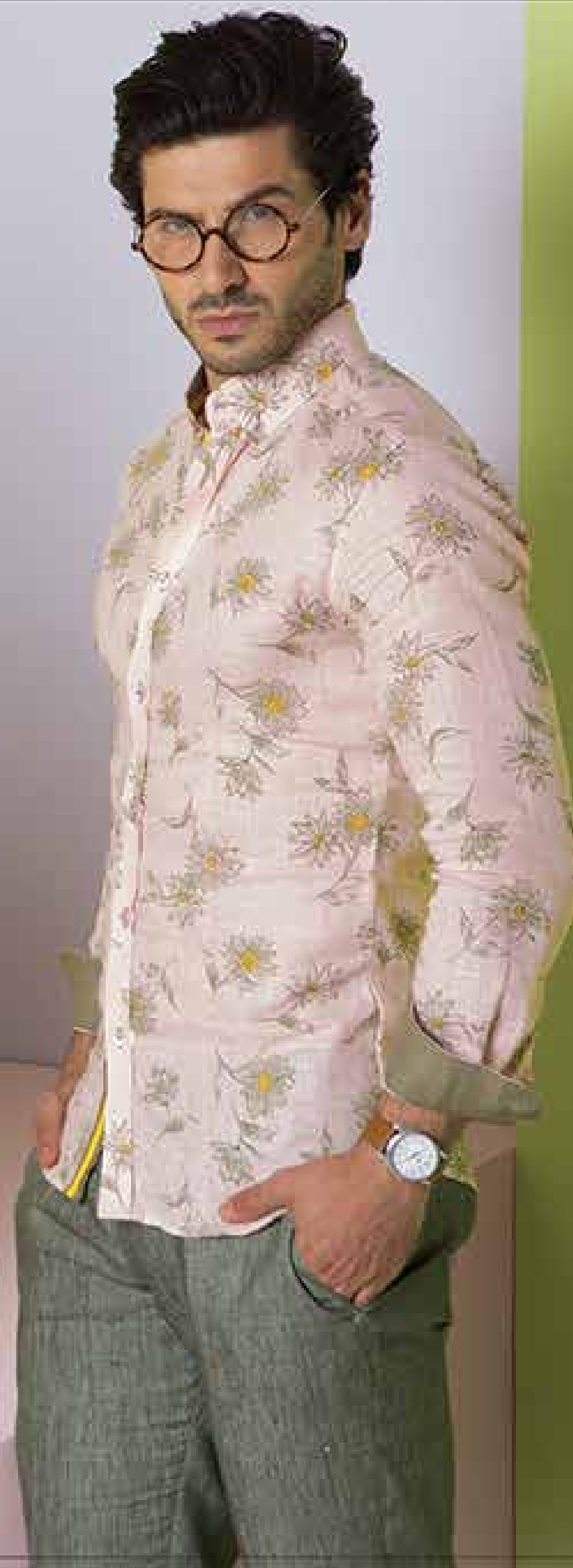
SHIRT ASHLEY - 2162/4