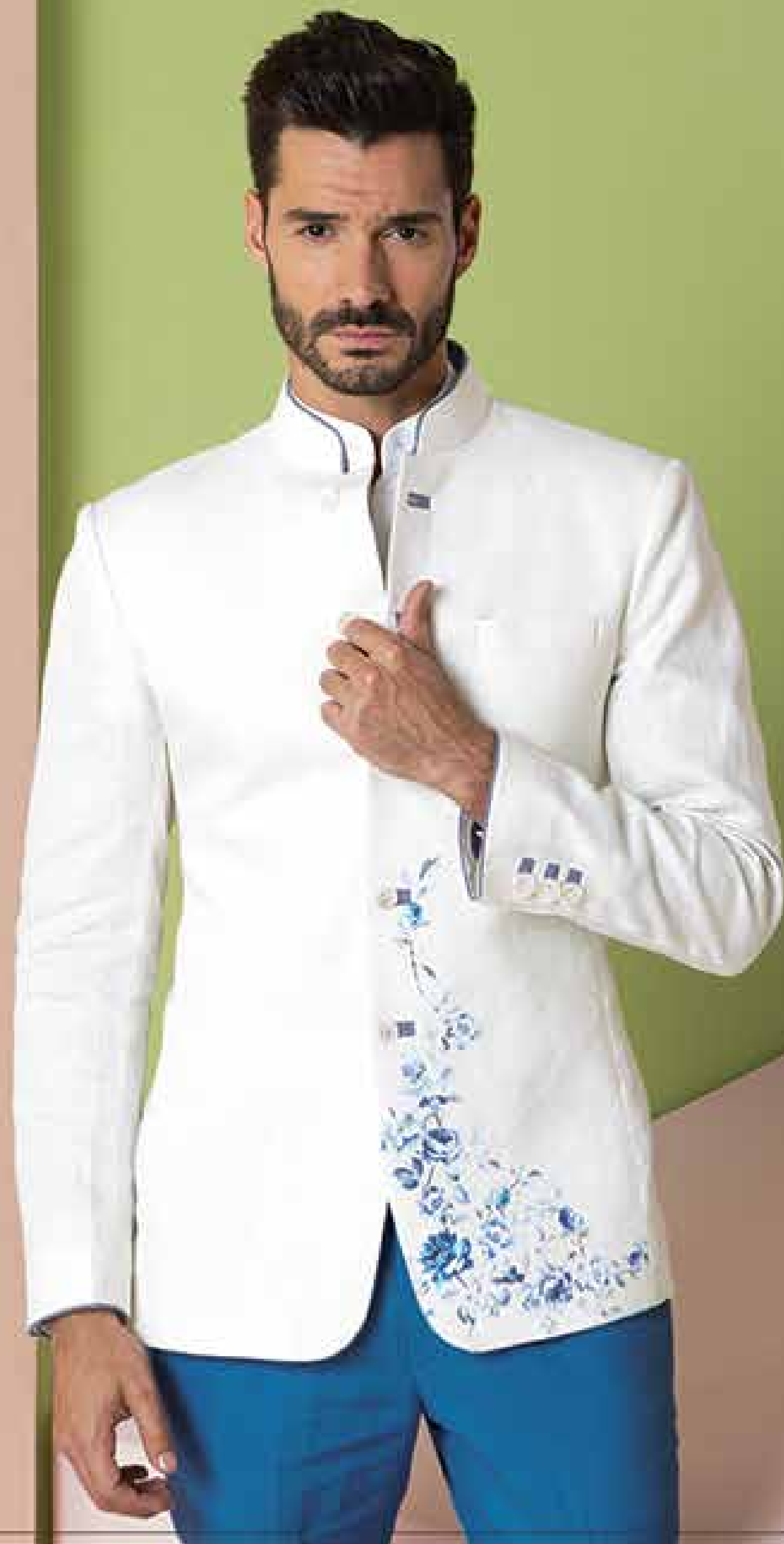
BLAZER DIGI ROOST - 151/1