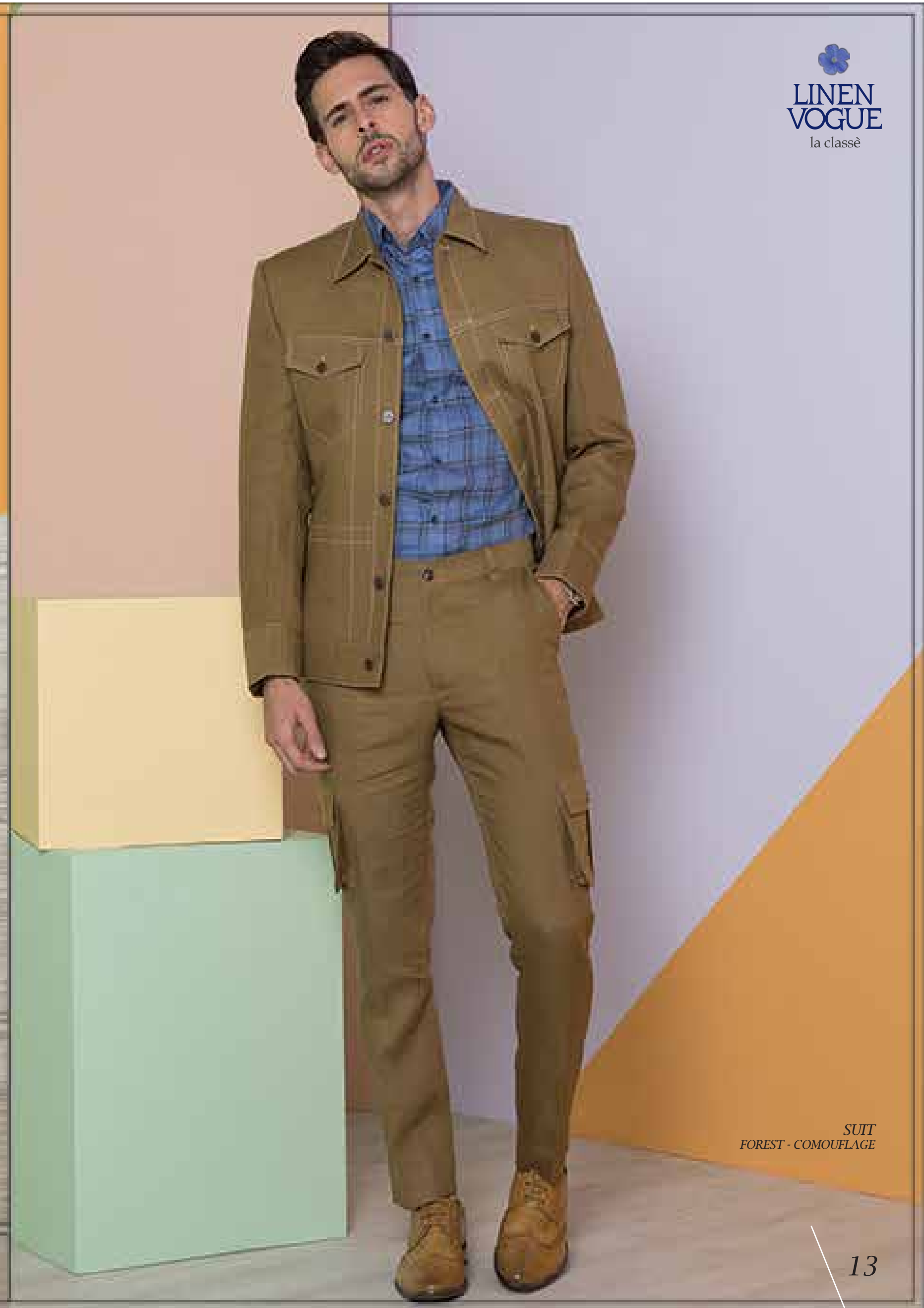
SUIT FOREST - COMOUFLAGE