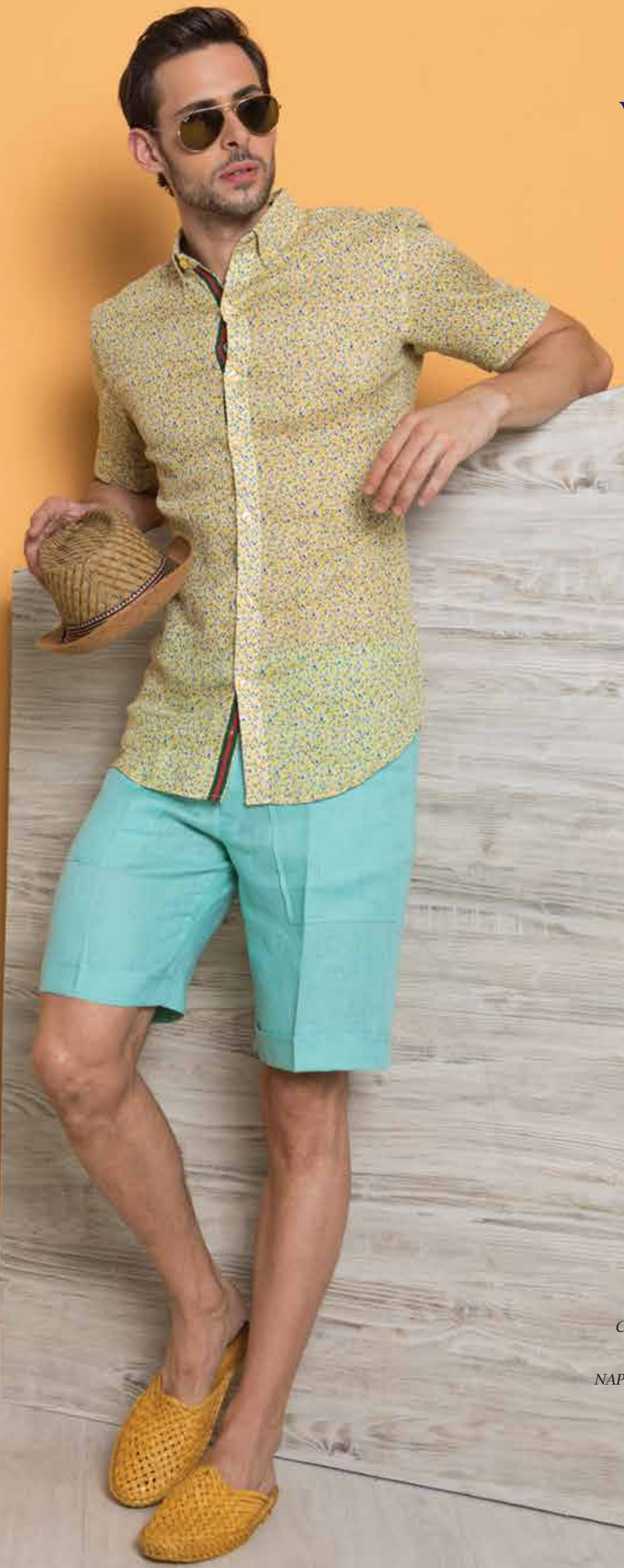
SHIRT CAMBRIA - 117/1 SHORTS NAPLES - SS - 18 - 65