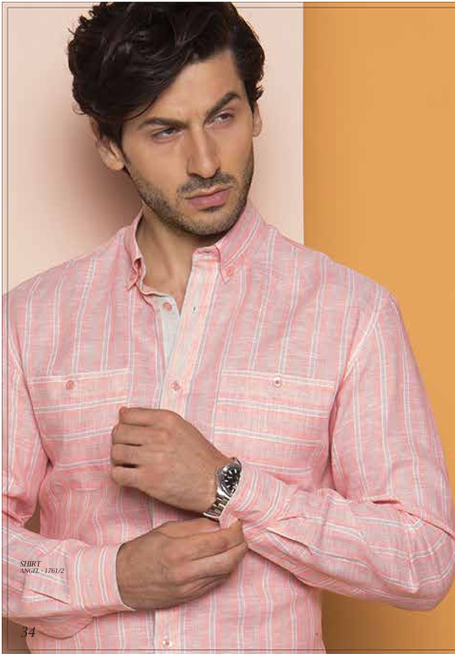
SHIRT ANGEL - 1761/2