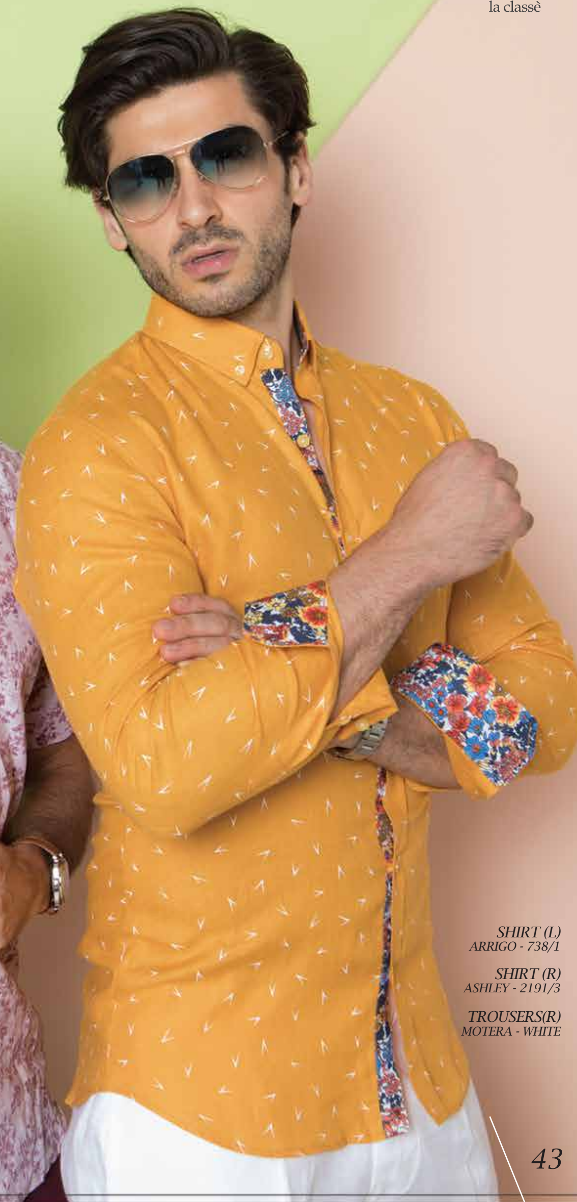
SHIRT (L) ARRIGO - 738/1 SHIRT (R) ASHLEY - 2191/3 TROUSERS(R) MOTERA - WHITE