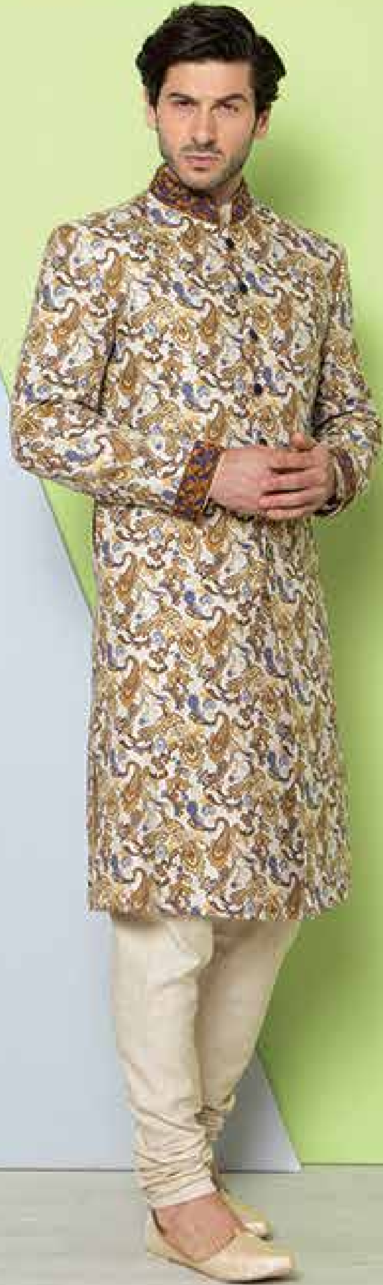
SHERWANI URBAN COCO - 147/1