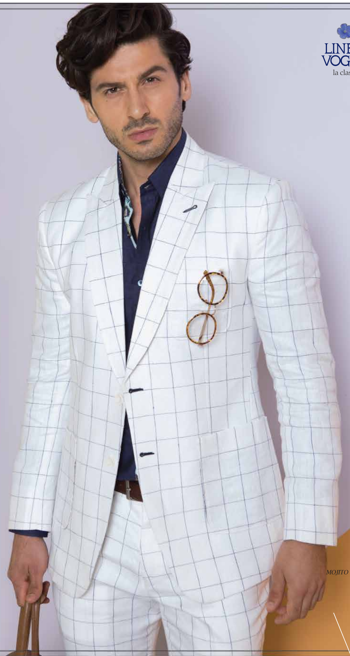
SUIT MOJITO - 553/1