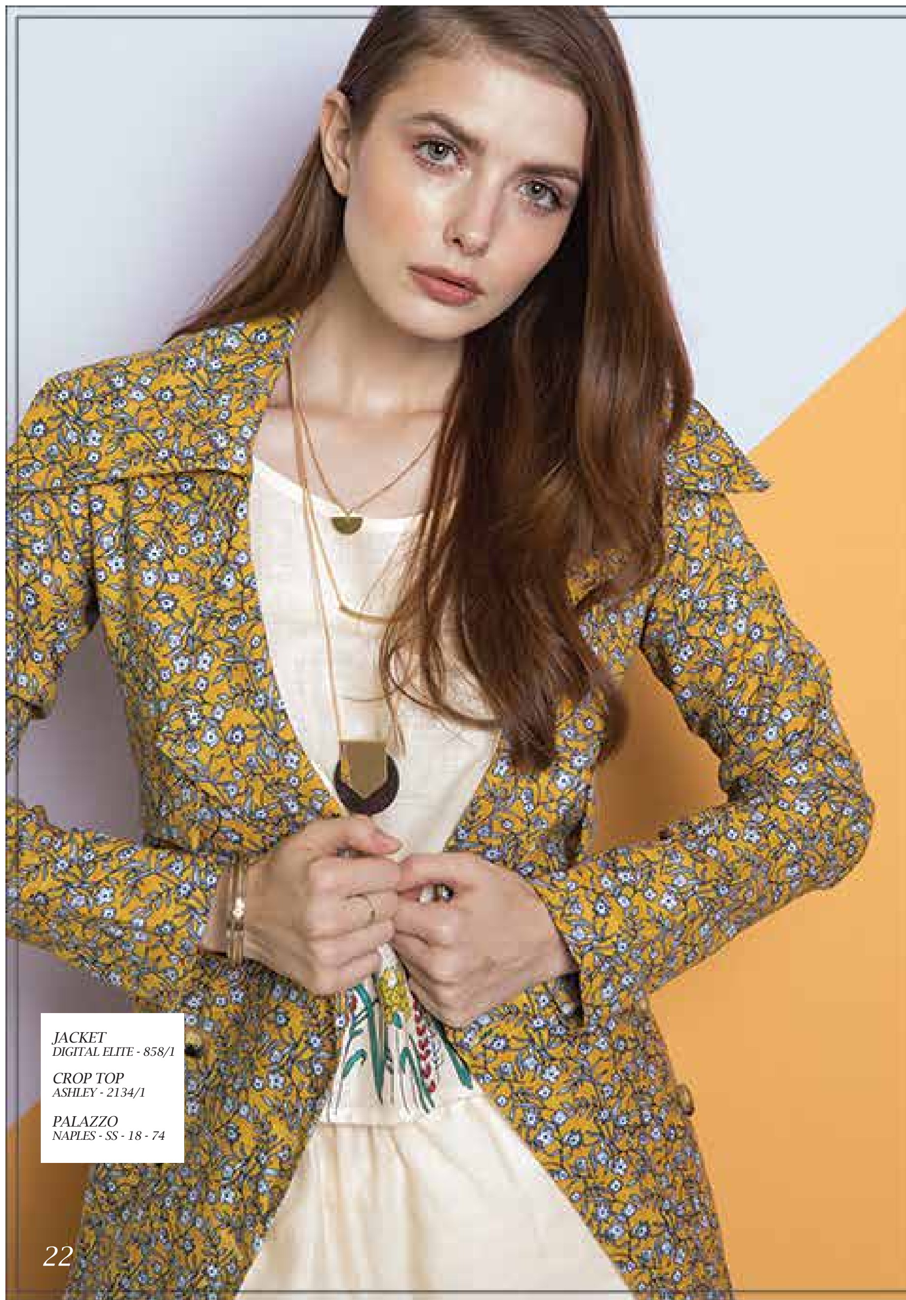
JACKET DIGITAL ELITE - 858/1 CROP TOP ASHLEY - 2134/1 PALAZZO NAPLES - SS - 18 - 74