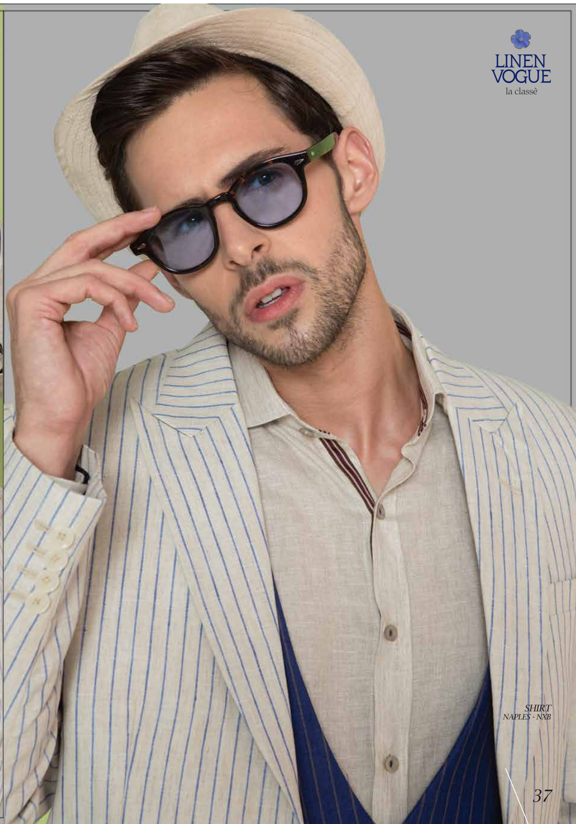
SHIRT NAPLES - NXB