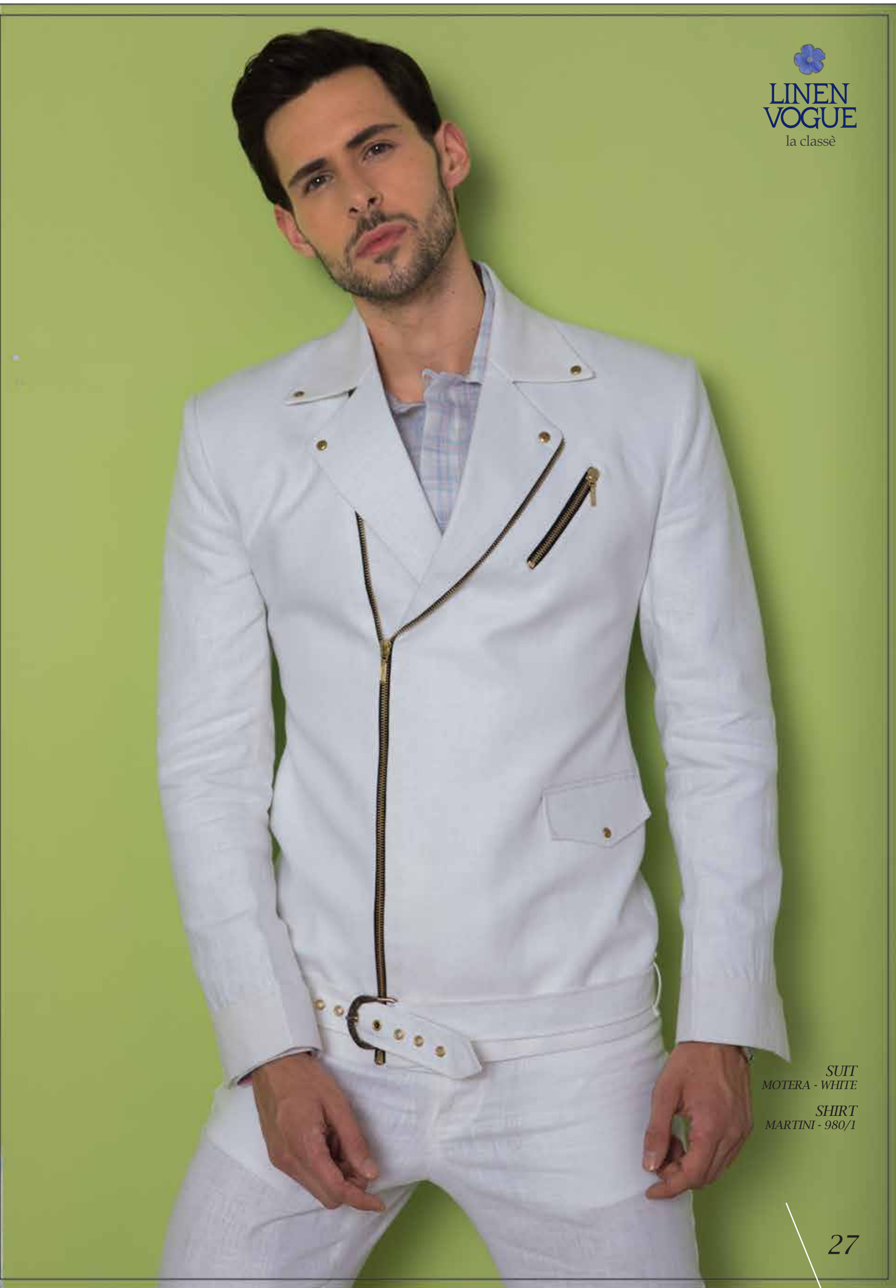
SUIT MOTERA - WHITE