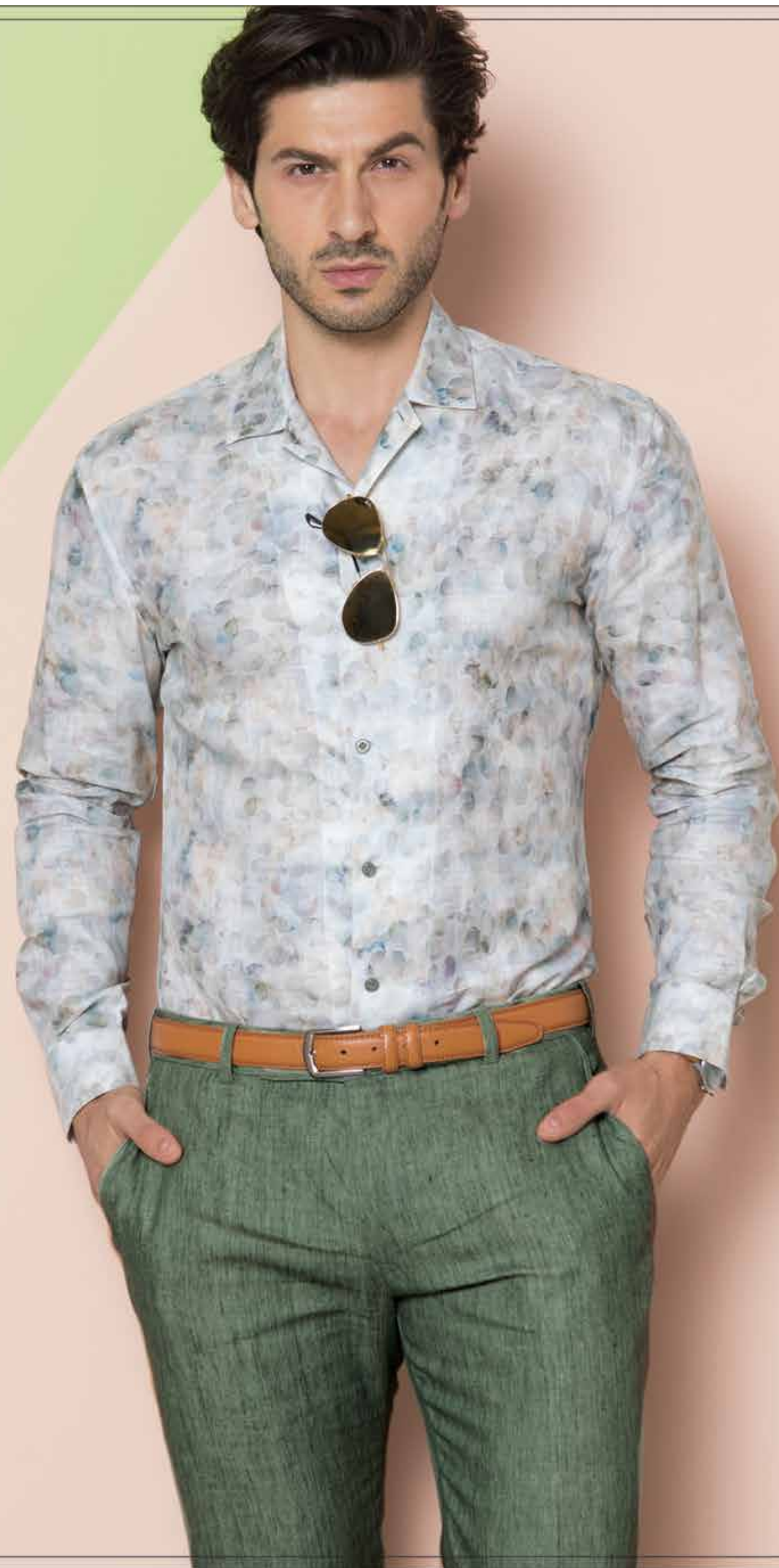
SHIRT DIGITAL ELITE - 688/2