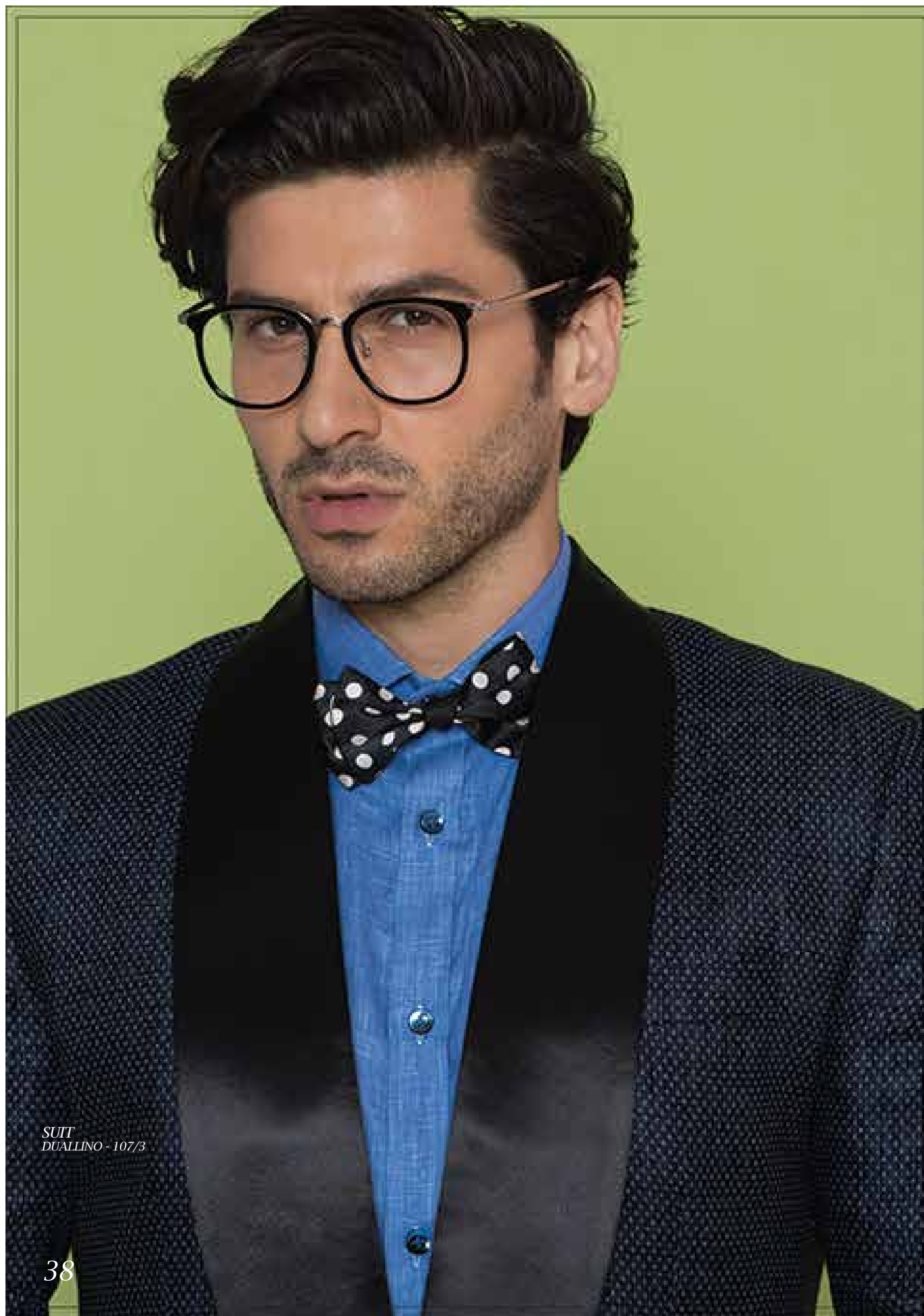
SUIT DUALLINO - 107/3