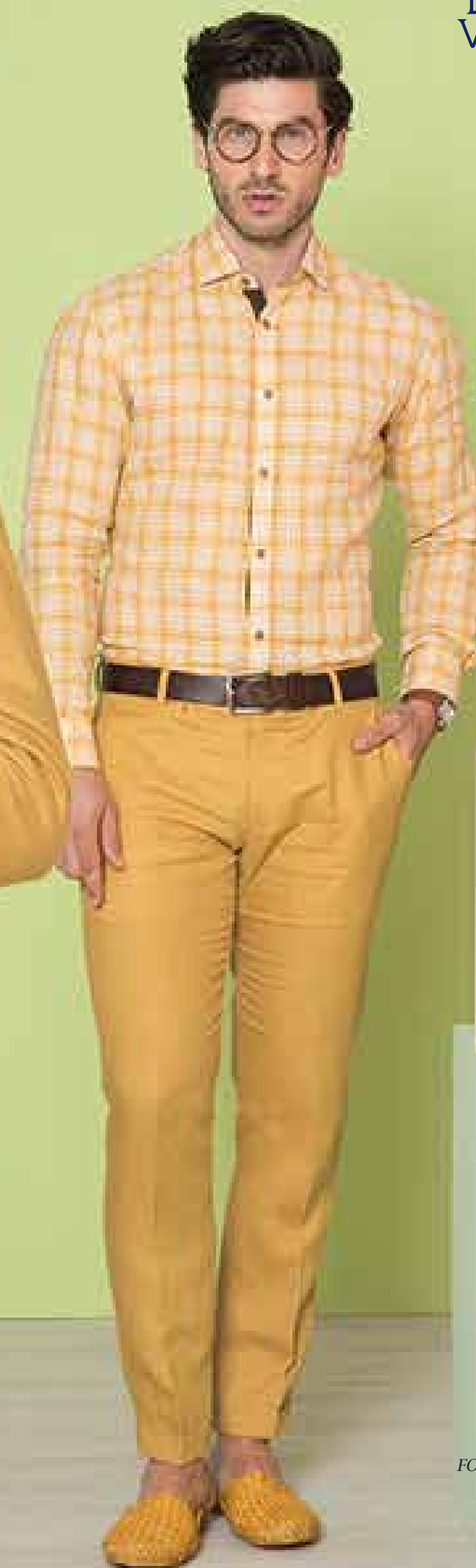
SHIRT ADVİK - 103/1