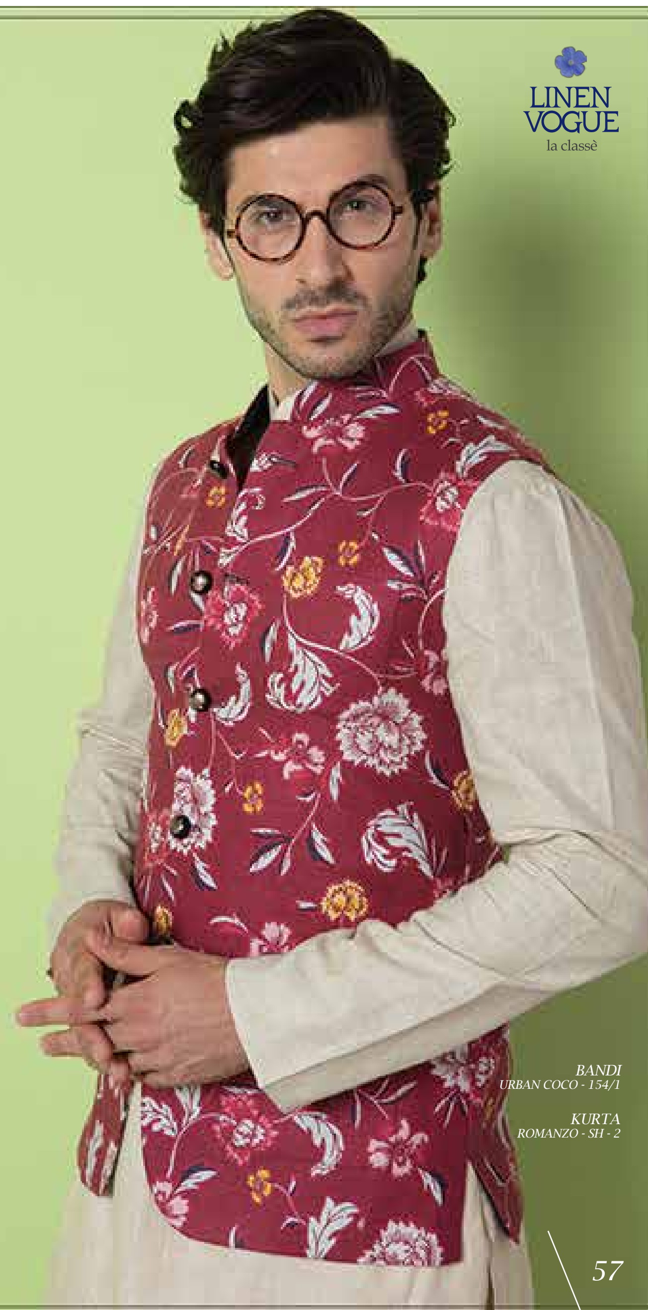
BANDI URBAN COCO - 154/1