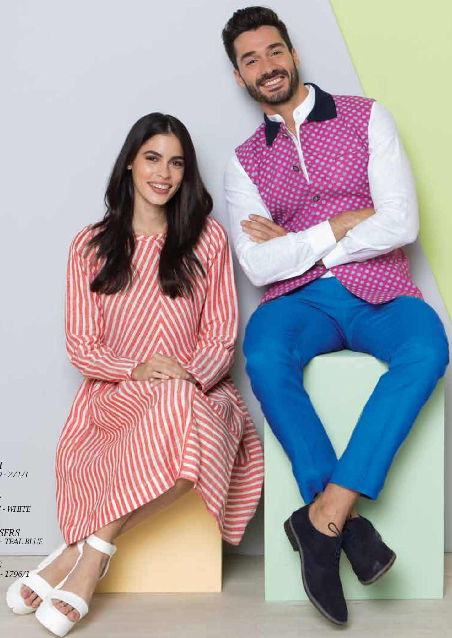
BANDI URBINO - 271/1