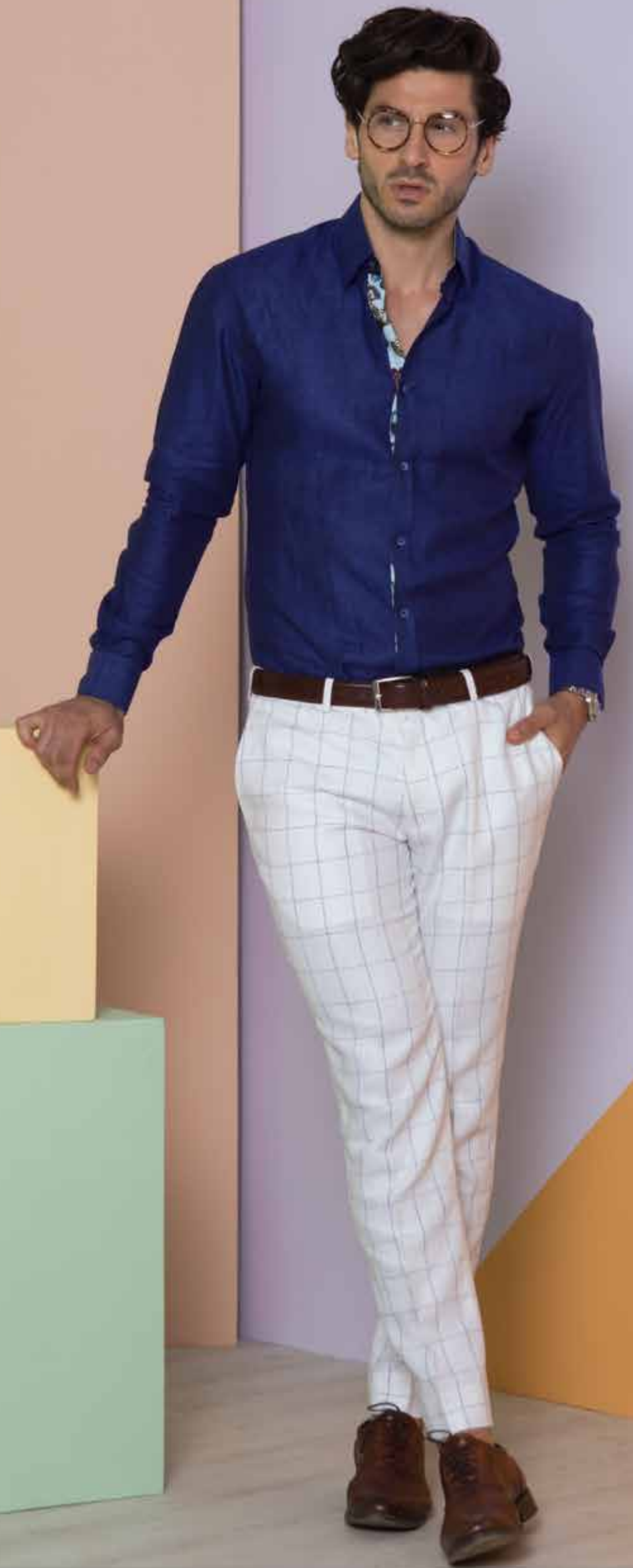
SHIRT PISA - SS - 18 - 36